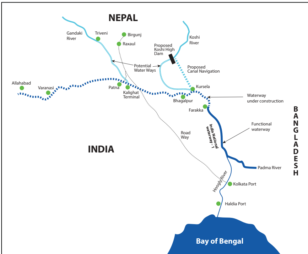
Figure 2. Potential waterways to connect Nepal with the Bay of Bengal.

Regional cooperation for the development of waterways has gained momentum in South Asia (Haran, 2018). Recently, the government of India declared 106 additional waterways and amended the bilateral navigation protocol between India and Bangladesh to allow third countries to use their waterways. Waterways along the Brahmaputra and Ganges Rivers could provide a basis for sub-regional connectivity for South Asia, connecting Bangladesh, Bhutan, the north-eastern states of India, and Nepal to the sea via the Ganges-Brahmaputra-Meghna basin. Nepal could be directly connected to the ports of Haldia and Kolkata through India's National Waterway 1 (Figure 2), Bhutan could be connected through the Manas River to the Brahmaputra at the Jogighopa confluence, and north-east Indian states could be connected to many ports on the Brahmaputra through National Waterway 2 (Figure 3). The best option for Nepal is likely to be linking by road to the proposed Kalighat terminal (Figure 2), which would substantially reduce the distance and cost of transportation to the ports of Haldia and Kolkata compared to current road and rail links. The proposed Koshi High Dam offers