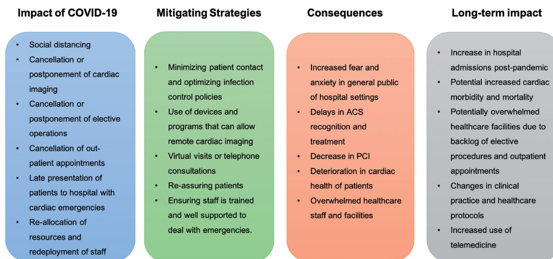
Figure 2. Summary of the impact of COVID-19 on cardiology services, mitigating strategies, their consequences and potential long-term effects.

Telemedicine also has a significant role in cardiac rehabilitation. Over 30 trials investigating the role of telemedicine in a cardiac rehabilitation setting have been published [44]. Results from a systematic review of these trials showed that there was a reduction in hospitalisation and cardiac events (risk ratio 0.56) with telemedicine compared with 'normal' cardiac rehabilitation; highlighting the efficacy of delivering cardiac rehabilitation remotely [44]. In addition, the ubiquitous use of the internet and smartphones in telemedicine makes it more accessible to track patients progress; this will ensure that patients are adequately monitored.