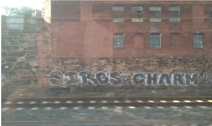
Figure 1. Tagging by tracks of the Southeastern PA Transportation Authority train in Philadelphia, PA.