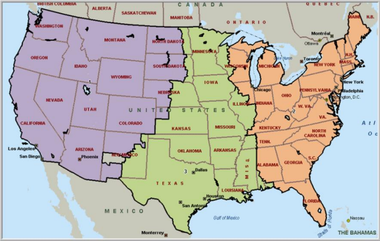
Figure 4-4: Original DC, Previously Determined Second DC, and Optimized Third DC Customer Allocation

the location of a third DC. Upon simulating the scenario of the original DC located in the western U.S., the previously determined second DC in the eastern U.S., and a third optimized DC location the DC Optimizer located the third DC in the southern U.S. Fresh’s transportation supply chain costs would total approximately $24.3 M. This results in an annual difference of $1.7 M, or a 6.5 % reduction in transportation costs from the current supply chain configuration with just the original DC located in the western U.S. Interestingly, there is no significant difference in transportation costs from this scenario to the optimized two DC scenario discussed in section 4.5.2. However, customer allocation changes dramatically from the two DC scenario to this three DC scenario. As shown in Figure 4-4, the customers allocated to both DC’s one and two naturally decrease, and the third DC is allocated customers primarily in the Midwest. In this scenario, 100% of the customers would be capable of being serviced within the three day service level requirement using ground transportation.