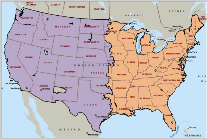
Figure 4-3: Original DC Location and Optimized Second DC Customer Allocation

transportation supply chain costs of approximately $24.3 M for Fresh. This results in an annual improvement of $0.2 M from the previously determined second location and a $1.7 M annual difference from the original DC location, or a 6.5% and 5.7% reduction, respectively, in transportation costs from the current supply chain configuration with just the original DC located in the western U.S. Customers would be allocated to each respective DC according to the line dividing the U.S. map shown below in Figure 4-3. It is noticed that due to the shift of the DC 500 miles northeast, the majority of customers located towards the south, including Texas, Oklahoma and Kansas, would no longer be serviced by the second DC. In this scenario, 100% of the customers would still be capable of being serviced within the three day service level requirement using ground transportation.