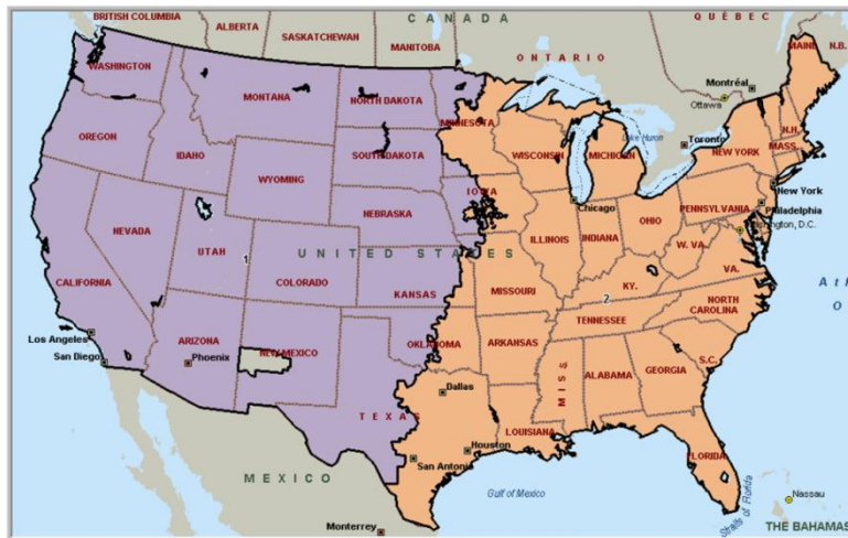
Figure 4-2: Original DC and Previously Determined Second DC Customer Allocation

Upon simulating the scenario of the original DC located in the western U.S. and the previously determined second DC in the eastern U.S., the DC Optimizer determined that Fresh's transportation supply chain costs would total approximately $24.5 M. This results in an annual difference of $1.5 M, or a 5.7% reduction in transportation costs from the current supply chain configuration with just the original DC located in the western U.S. Customers would be allocated to each respective DC according to the line dividing the U.S. map shown below in Figure 4-2. In this scenario, 100% of the customers would be capable of being serviced within the three day service level requirement using ground transportation.