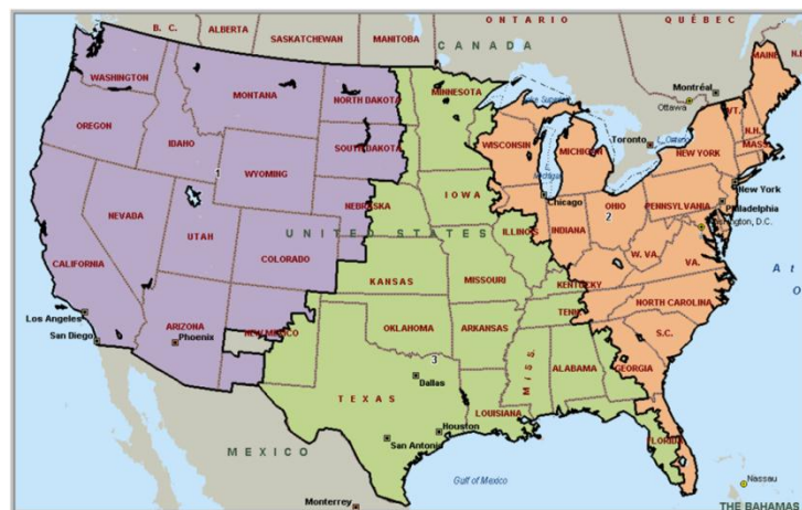
Figure 4-5: Original DC and Two Optimized DC Locations Customer Allocation

Upon simulating the scenario of the original DC located in the western U.S and two optimized DC locations, the DC Optimizer located the second DC in the same eastern location as the optimized result in the 2 DC scenario and the third DC in the same location as 4.5.3. It was interesting that regardless of the second DC's location in the eastern U.S. it had no effect upon the location of the third DC in the southern U.S. Fresh's transportation supply chain costs were shown to total approximately $24.0 M. This results in an annual difference of $2 M, or a 7.7 % reduction in transportation costs from the current supply chain configuration with just the original DC located in the western U.S. Furthermore, it is a $0.3 M reduction, or 1.2%, from both the three DC scenario and optimized two DC scenario discussed in sections 4.5.3 and 4.5.2, respectively. Customer allocation among the DC's changes slightly when compared with the allocation resulting from the previously discussed three DC scenario. In this case, the third DC now services areas further east including Alabama and parts of Kentucky, Georgia, and Florida (see Figure 4-5 below). In this scenario, 100% of the customers would be capable of being serviced within the three day service level requirement using ground transportation.