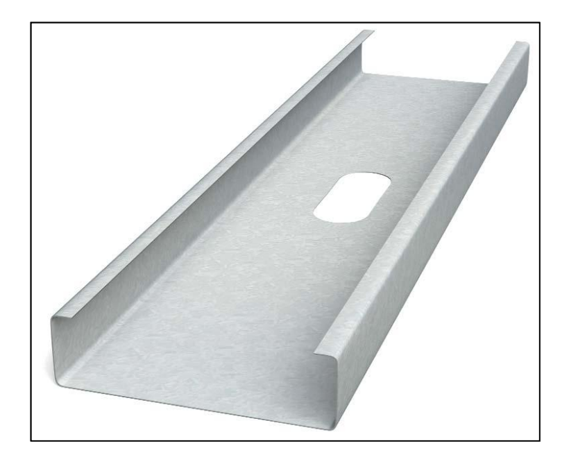
Figure 1: Picture of a C-Stud.

<u>C-Shape</u> - A cold-formed steel shape used for structural and non-structural framing members consisting of a web, two (2) flanges and two (2) lips (edge stiffeners). See Figure 1.