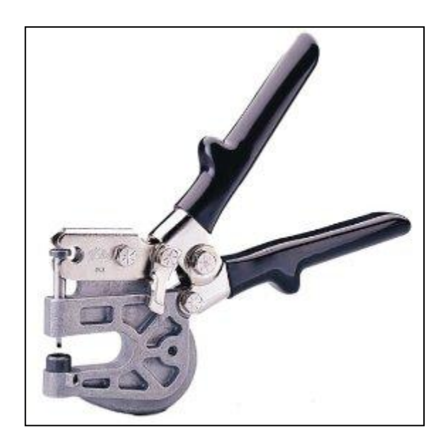
Figure 2: Picture of a clinching tool.

<u>Clinching</u> - a mechanical fastening method to join sheet metal without additional components using special tools to form a mechanical interlock between the sheet metals. The tools consist typically of a punch and a die. There are two primary types of dies: solid "fixed cavity" dies, and dies with moving components. The punch forces the two layers of sheet metal into the die cavity forming a permanent connection. The pressure exerted by the punch forces the metal to flow laterally. Clinching is used primarily in the automotive, appliance and electronic industries, where it replaces spot welding very often. See Figure 2.