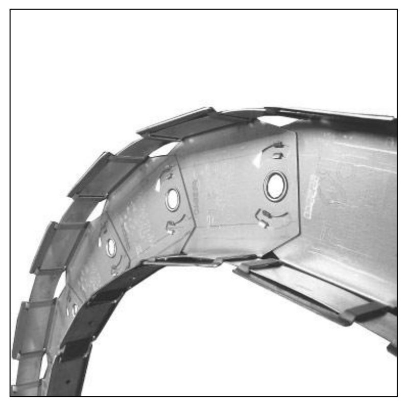
Figure 4: Flex-C Trac. (http://www.proplaster.com.au/ products/flex-c-trac-system-with-hammer-lock-feature)

Flex-C Trac (see Figure 4) with Hammer-Lock feature is offered by Flex-Ability Concepts. The company produces track for light gauge steel framing that curves, allowing the builder to quickly erect curved walls and arched doorways. The Flex-C Trac with hammer lock offers a feature where "once the track is formed simply hammer down the tabs to secure the shape. It's fast and strong (Flex-Ability Concepts, 2007)."