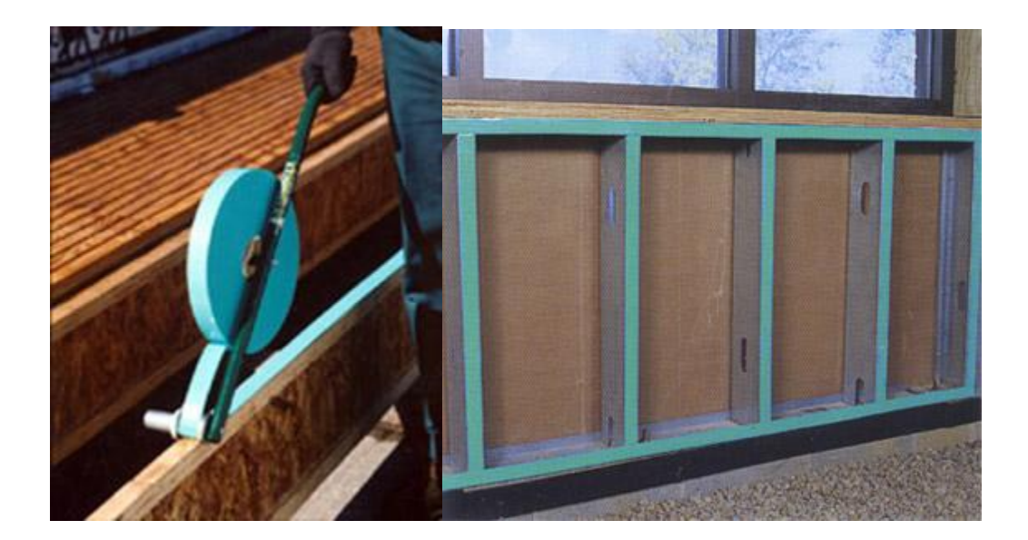
Figure 6: Integrity<sup>™</sup> Gasket forms a thermal break at external wall framed with metal studs to prevent "shadowing" on gypsum board and reduce sound transmission. (http://www.integritygasket.com/oldgallery1.asp)

A light gauge steel framer, Erik Elwell has framing with light gauge steel down to a science. One of the things he incorporates in his work is foam strips called Shadwell 143 Integrity Gasket shown in Figure 6 that attach directly to the studs and tracks – between the screws. This enhances the sound attenuation of the walls and creates a flat surface for hanging drywall (Elwell, 2005).