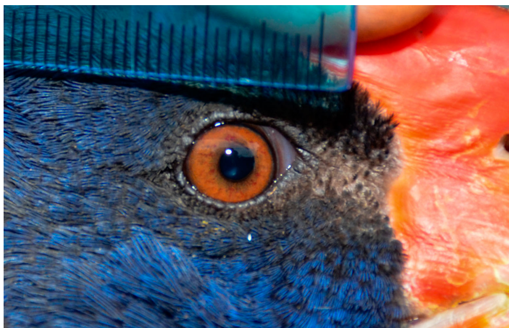
Figure 2. Photograph of the right eye of a takahe, demonstrating the generalised tan colour, round pupil and multiple areas of prominent iris vascularity.

of 1 mm miosis to light exposure with a bright torch from being indoors in a moderately dim room, constricting from approximately 4.5 mm to 3.5 mm. The iris was in all cases a tan brown with several areas of prominent vascularity evenly scattered around the surface (Figure 2).