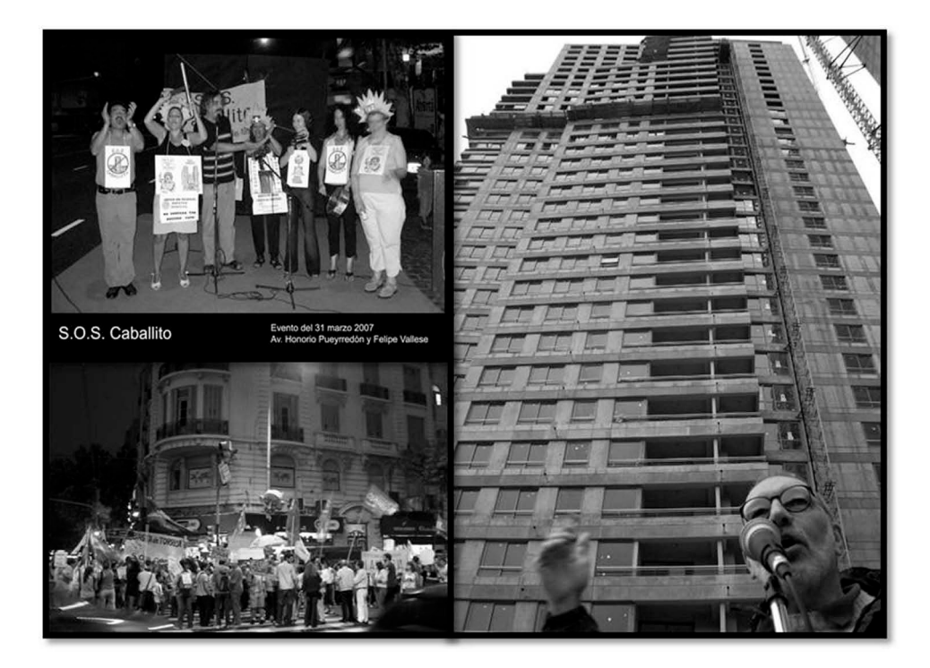
Figure 3. Events SOS Caballito 2007 and 2010. SOS Caballito (n.d.).

when a personal concern is transformed into an external issue - in our case, urban politics (Roth & Rucht 2008).