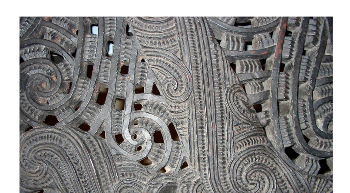
Figure 1. Whakairo/carving on the stern of a nineteenth-century waka taua/Maori war canoe in the collection of the Auckland Museum, containing a number of elements with oceanographic relevance (image: Kahuroa/public domain).

science, where data are sometimes protected due to commercial restrictions, publishing priority or (unintentionally) through lack of resources.