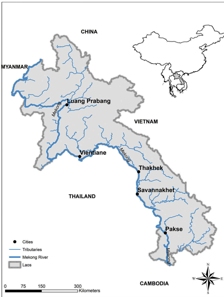
Figure 1. Map of Lao PDR.

nourishment is typically undermined by lack of diversity and poor quality in both nutritional content and food safety (Bouapao et al., 2016).