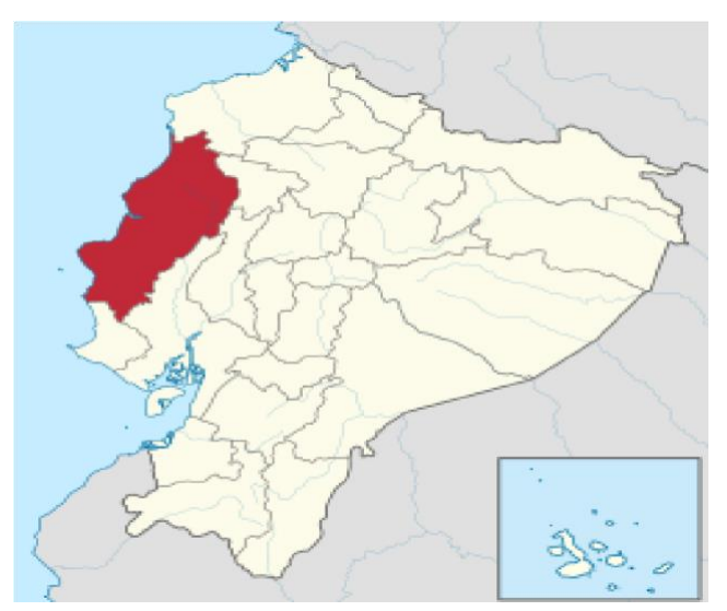
Figure 3. The 24 political provinces of Ecuador, including the Galapagos in map subset. Manabí is highlighted in red.

settlement. The first human settlements in the region date back to 3600 BP<sup>1</sup> (Pearsall & Zeidler, 1994). Rich soils, access to fisheries, a temperate climate, and the availability of freshwater