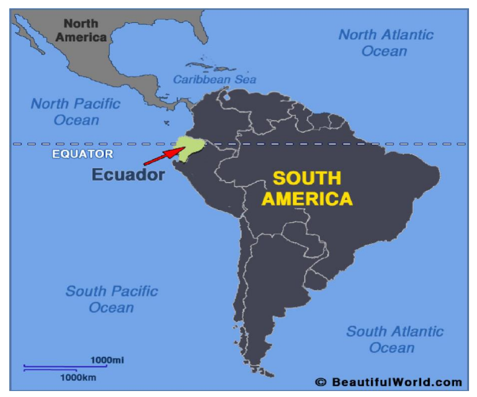
Figure 1. Geographical location of Ecuador, flanked by Colombia, Peru and the Pacific Ocean. Republica del Ecuador, 2008). Although the updated constitution appears to safeguard the environment and indigenous territories, it provides loopholes that support extractive economies. Certain articles and provisions of the constitution (as well as the preexistent Forestry and Wildlife Law of 1981) maintain that the country's natural resources are to be managed by the national government for the common good of Ecuador's people, allowing for extractive activities in designated protected areas (Kimerling, 1991; Lalander & Merimaa, 2018; Lewis, 2016).

The dependence of Ecuador's national budget on income from petroleum exports-which is susceptible to the fluctuating prices of international oil markets-creates what the government perceives to be a dichotomy: social development and environmental conservation (Lalander & Merimaa, 2018). An important contributor to extractive pressures on Ecuador's environment is the country's international debt burden. In 2008, when Ecuador defaulted on two of its outstanding bonds, the country lost access to its main Western creditors. China's Development