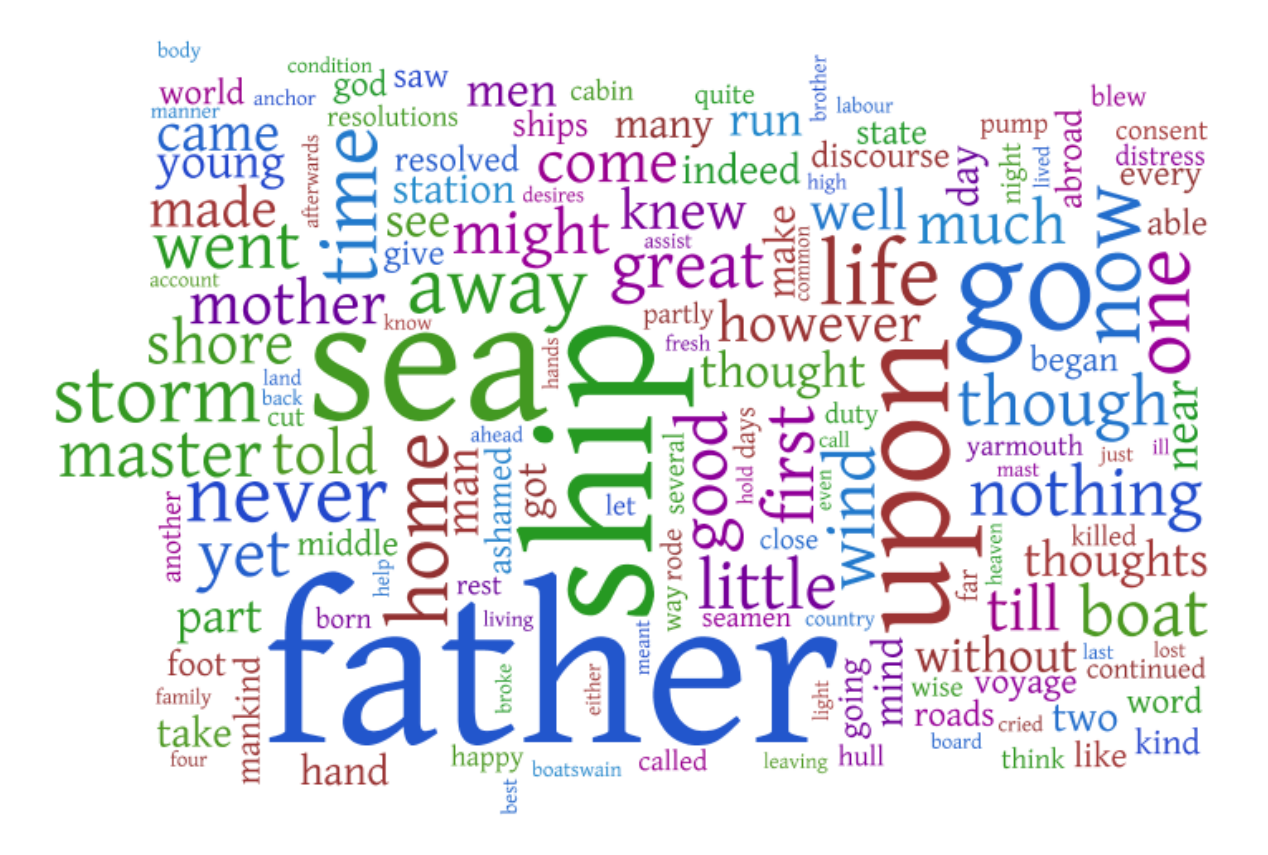
Figure 3. Word Cloud ("Wordle") from Chapter 1 of Robinson Crusoe