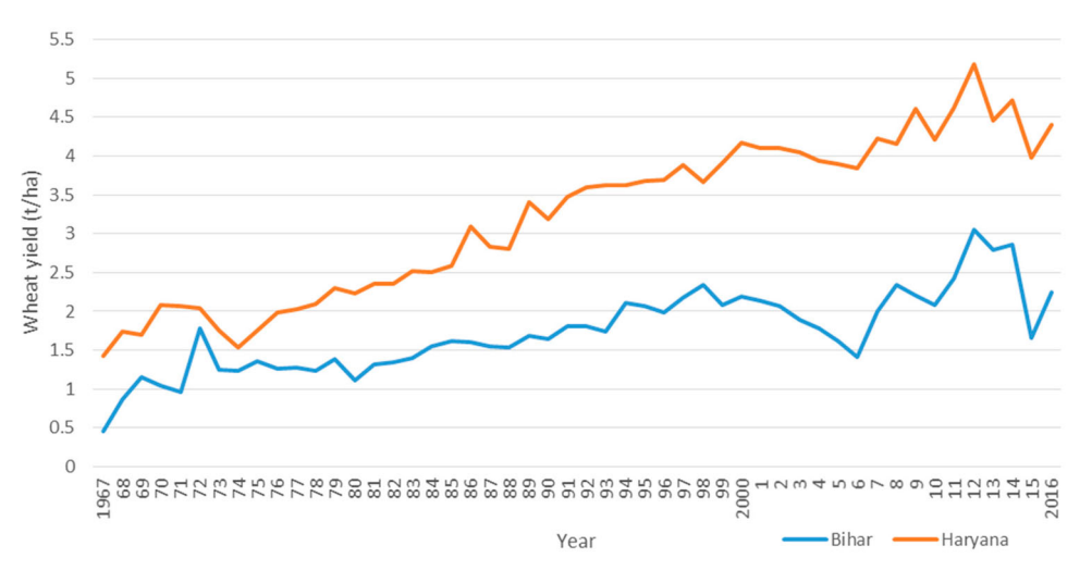
Figure 1. Average wheat yields from 1967–2016 for the states of Bihar and Haryana in the Eastern and Western Indo-Gangetic Plains, respectively.

the analysis to estimate per-unit production costs; (3) in comparison to the previous assessment by Keil et al. (2015) who used a Stochastic Frontier production function, we apply a methodologically superior approach that takes potential systematic differences between ZT users and non-users into account and allows all regression coefficients to vary between ZT and CT production systems, rather than assuming a shift of the production function.