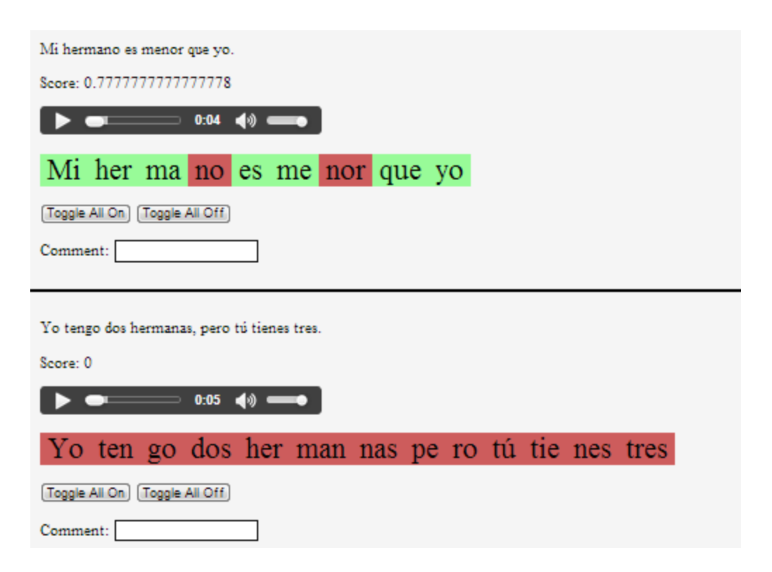
Figure 1. Example of rating tool interface.

Hand rating was labor intensive. For this project, 11,820 items were rated. To help with the task, in addition to the primary researcher, six Spanish speakers were trained how to rate. After helping the raters become acquainted with the rating tool, they were instructed on the following rating guidelines.