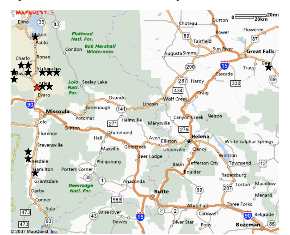
Figure I: Western Montana Growers Cooperative Member Locations

As of 2006, the Western Montana Growers Cooperative had fifteen member farms located in the Flathead, Jocko, Mission, and Bitterroot Valleys and Belt, Montana. Figure 1 shows Western Montana Growers Cooperative member locations on a map of Western Montana. Most members grow produce on small acreage vegetable farms and orchards, and some supply meat and dairy products. Many members are certified through the USDA National Organic Program, but some practice organic methods without certification (Wehri 2005). The Co-op sells a wide range of items, including fresh fruits and vegetables, several chopped and bagged produce items, organic dairy products, honey, and a variety of meats such as poultry, natural beef, pork, and bison. They also serve as a freight carrier for processed foods produced by several Missoula based businesses, charging a freight fee for delivery, but not managing the sale of those items.