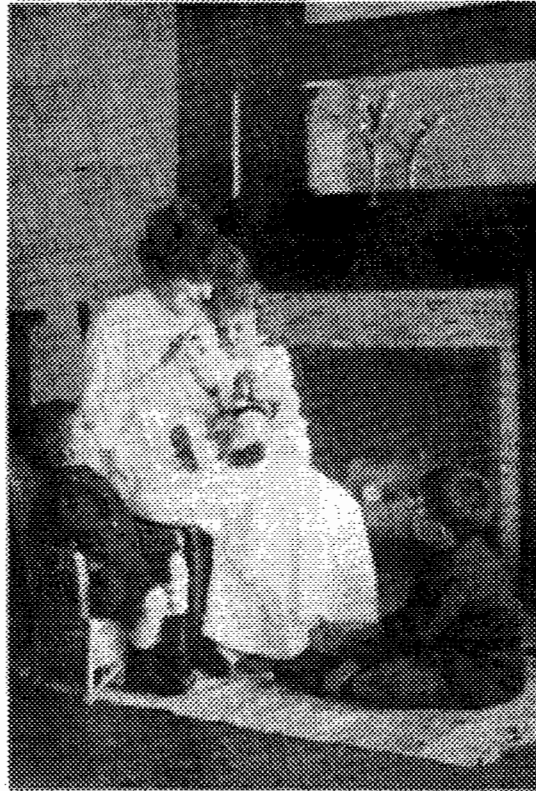
FIGURE 3. A STUDENT OF MOTHERCRAFT PRACTICING STORYTELLING.