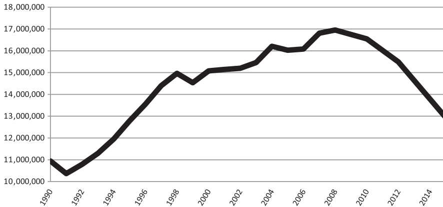
Figure 1. GDP Per Lawyer (constant US$).

including the curricula in legal education, the focus of key debates in legal press, conferences and even informal gatherings, the selection of arguments deemed “strong” and “convincing” in a courtroom, and the desired and actual image of a lawyer in society.