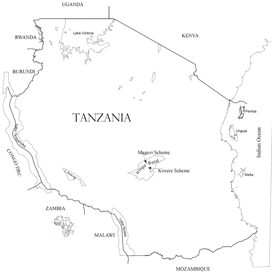
Figure 1. Location of Kiwera and Magozi irrigation schemes.

age of household heads is 46 and 43, respectively (Table 1). Agriculture, rainfed and irrigated, is the main source of income. More than a quarter of households experienced food insecurity over the last five years, while more than 90% consider themselves to be in good health.