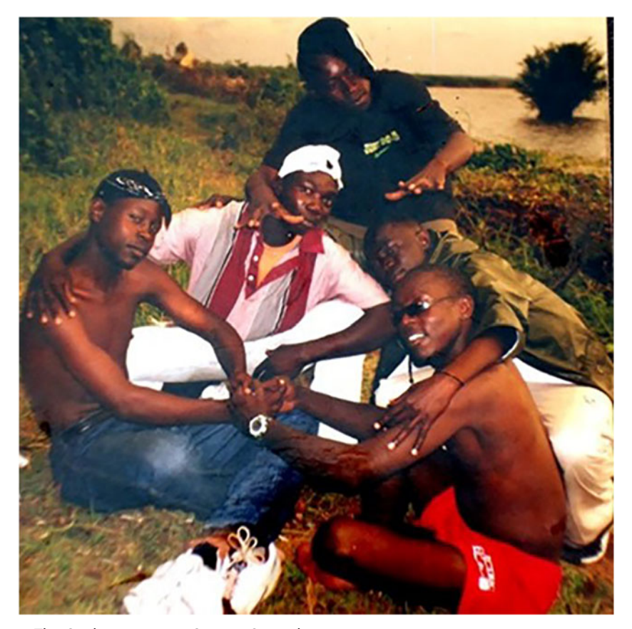
Figure 1. The Starkuzz in 2002.

entrepreneurial hustling activities like Atomic's semi-legal telecommunications activities in the city, or combining subsistence farming and fishing with 'squad' motorcycle taxi services (occasional hire of motorbikes from owner-friends for single fares) in rural areas where opportunities for hustling were reduced (Aellah and Geissler 2016).