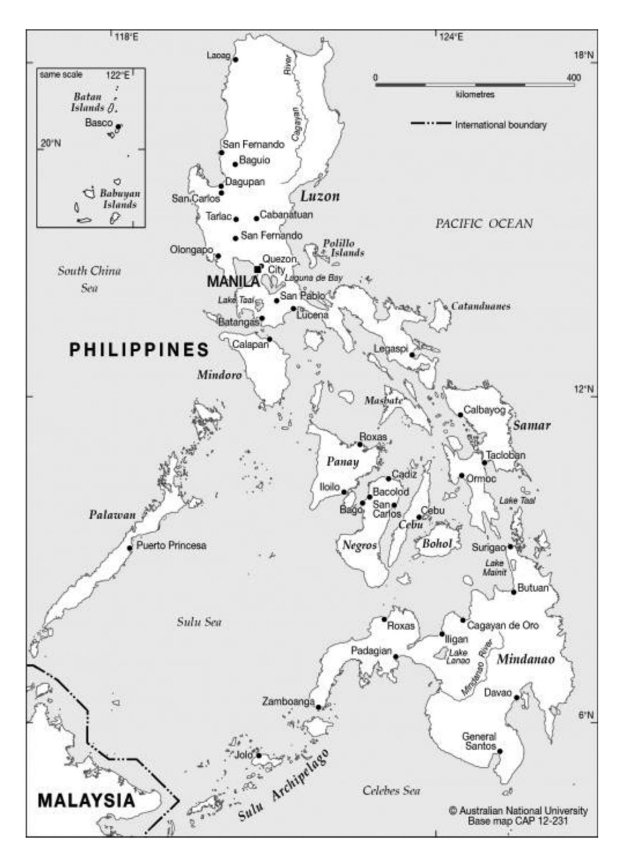
Map 1. Map of the Philippines.