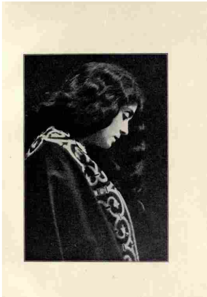
Figure 3 Eleonora Duse, from Teasdale’s book.

Ibsen specifically allowed actresses to interrogate assumptions about womanliness, which involved, for some characters, a repudiation of feminine roles including family: “The sum of the matter is that unless Woman repudiates her womanliness, her duty to her husband, to her children, to society, to law, and to everyone but herself, she cannot emancipate herself” (Shaw “The Womanly Woman” 43). This kind of conflict, between personal will on one side and marriage and family on the other appears in many of Teasdale’s early poems, suggesting this was a specific kind of affinity she had for Duse.