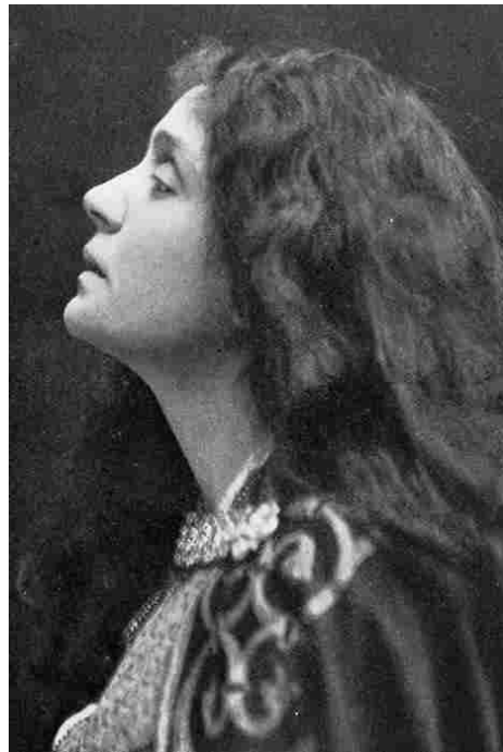
Figure 1 Eleonora Duse, photograph from Teasdale's Sonnets to Duse and Other Poems .

Beginning with Wroth, women writers have written despite gendered expectations in various ways, and the sonnet has adapted to accommodate those new ideas and identities. It is true both that the sonnet has a history that is present in each new instantiation of the form and that the form adapts to new ways of investigating conflict extremely well; this seemingly paradoxical relationship to its own past explains the durability of the sonnet and adds depth to these poems of poetic persona.