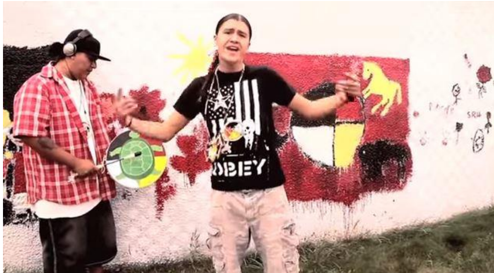
Fig 2: A screen shot from Frank Waln's "Oil 4 Blood"

Reservation and its voyeuristic gaze into the lives of impoverished Native Americans without citing the historical disenfranchisements that led up to current conditions, and without implicating the viewer in any course of action. Rather than being “pimp[ed] for money” as “poverty porn,” Waln asserts that he is a warrior. In doing so, he asks for a revised, dignified, and multifaceted representation of Indigenous peoples that resonates with the protests of previous generations. 7