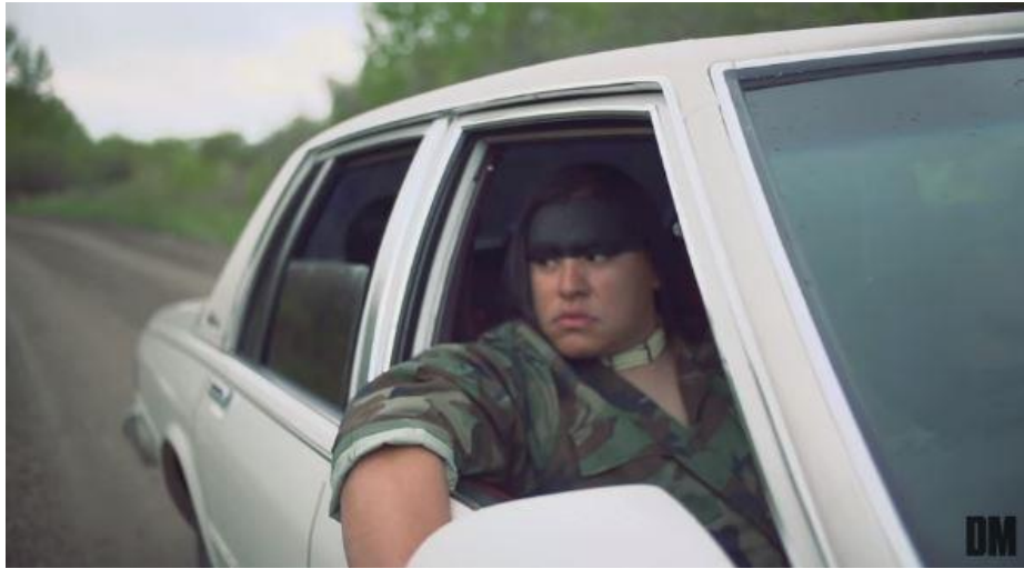
Fig. 4: A video screenshot from “Warpath” by Drezus.

In “Champions” by The NorthStars (Quebec First Nations), the ingenuity of combining old and new elements to survive becomes a medium for asserting Indigenous pride. The artists rap about surviving tough conditions and boast of their resilience: “Rising from the underground buried in dirt / But now we’re standing on the frontline bringing the beats / Destroying opposition while we’re living the dream” (NorthStars). In the music video, the artists alternate between wearing hoodies and tees, camouflage hunting gear, and sunglasses and baseball caps. They rap in front of houses covered in plywood and on a mountaintop setting surrounded by forestry. There is also footage of a training athlete wearing a tank that says “First Nations Warrior” performing pushups and chin-ups in a construction yard and running along the highway shoulder. In the same way that the athlete never stops training, the video suggests that First Nations people will never stop celebrating their cultural identities, no matter how difficult it becomes.