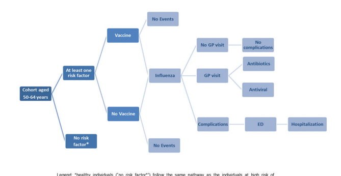
Figure 1. Flow diagram of study population in the model.

The resident population in Liguria on 1 January 2019, broken down into the three age-groups of interest, was obtained from the National Institute of Statistics.<sup>28</sup> The study population was also stratified by risk factors for developing complications with the presence of at least one of the following diseases: renal failure, cancer, diabetes, cardiovascular disease, chronic obstructive pulmonary disease, and gastrointestinal, neurological and autoimmune diseases. 25,29 The proportions of subjects without risk factors (NRF) and with risk factors (WRF) were calculated by applying the percentages obtained for each