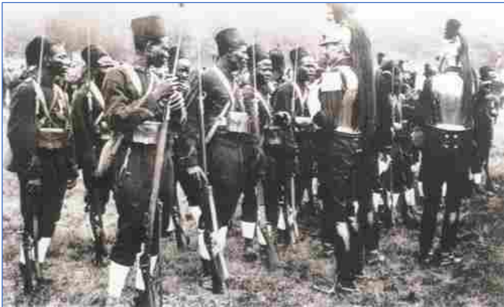
French West African soldiers served in the troop Senegalese Tirailleurs in France, WWI.

French West African troops serving in World War I comprised about 170,891 men, and approximately 30,000 of them were killed. In Senegal alone more than 1/3 of all males of military age were mobilized. Following World War I, the Conscription Law of 1919 in French West Africa called for universal male conscription in peacetime as well as wartime. Hundreds of thousands served in the Senegalese Tirailleurs in colonial wars in this time period and in reserves and labor brigades (Kentake, 2015).