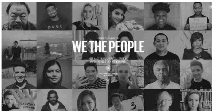
Figure 4. Video still from We the People