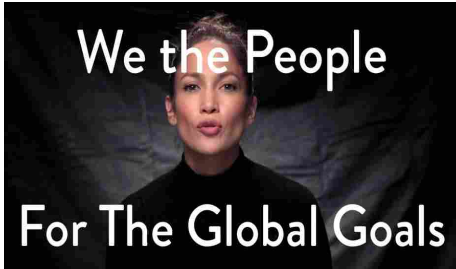
Figure 9. Jennifer Lopez in We the People

The film begins with 'We The People' written in bold, black typeface accompanied by the colorful logo of Global Goals. The video starts with celebrities highlighting the potential of 'we' as being the 'first, determined' generation to end poverty, tackle inequality and mitigate climate change. It has been created by Richard Curtis, Mat Whitecross and the Rumpus Room with an objective of apparently capitalizing on the fanbase of different celebrities. The 2 minutes 58 seconds video includes headshots of celebrities who speak about the goals and outline the plan to achieve them.