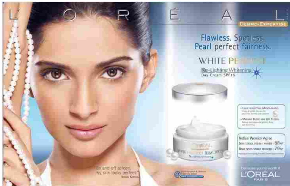
Figure 13. Sonam Kapoor in an ad of Loreal White Perfect Cream

Considering her case, it is important to explore the merits for selection of celebrities by Global Goals campaign. It is dangerous for the campaign to select one of its opinion leaders who stands for such regressive set of values. Recently, this advertisement was brought to the forefront on Twitter by one of her actor colleagues criticizing her stance on fairness creams. She retaliated by posting the picture of the colleague's sister who had done a similar shoot for a fairness cream. Snubbed for her childish behavior by Twitterati, she later deleted the post and expressed oblivion of the ramifications of the shoot.