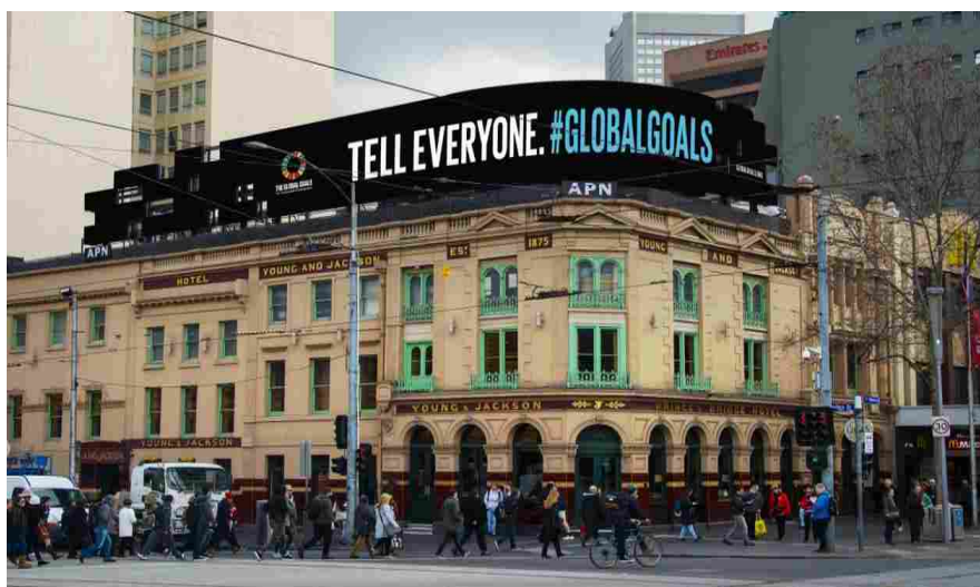
Figure 5. A Posterscope site