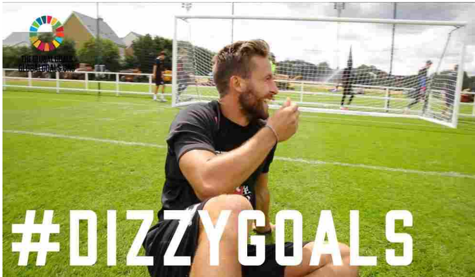
Figure 6. A still from #Dizzy Goals video

Sportspeople like Usain Bolt and Gareth Bale posted their videos of Dizzy Goals on YouTube facilitating the awareness of Global Goals. Dizzy Goals is based on the players making 17 rounds (signifying the 17 goals) around a soccer ball and then hitting it in the goalpost. The idea is to signify that the governments should be able to hit the goals by the year 2030.