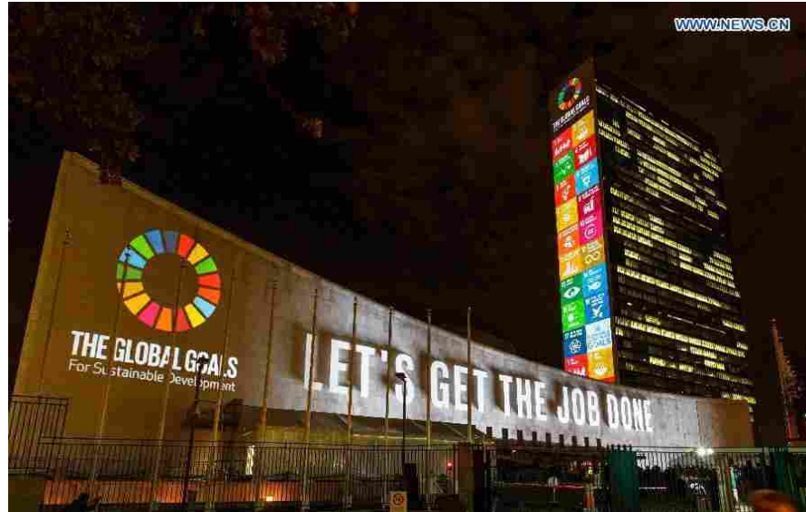
Figure 7. Global Goals Projection on UN Building

A large image of Global Goals was projected on the north façade of the Secretariat building of United Nations headquarters on September 22 nd 2015. The projection highlighted the progress of Millennium Development Goals and exhorted world leaders to ‘get the job done.’