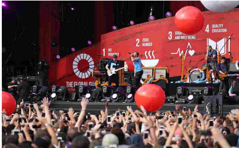
Figure 3. Coldplay in action at Global Citizen Concert

The Global Citizen festival coincided with the launch of Global Goals and was held in New York. A power line-up of celebrities like Coldplay and Beyonce, politicians like Swedish Prime Minister Stefan Lofven and heads of multilateral organizations reiterated their commitment to the goals and called on everyone to contribute their bit in making the goals a success. The concert was attended by 60,000 global citizens and was simultaneously broadcasted in more than 70 countries (Global Citizen, 2015).