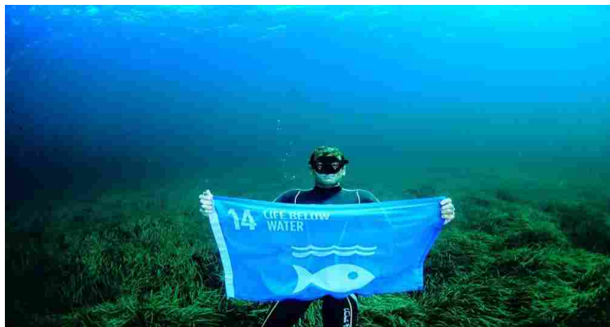
Figure 8. Flag of Global Goal 14 unfurled under water