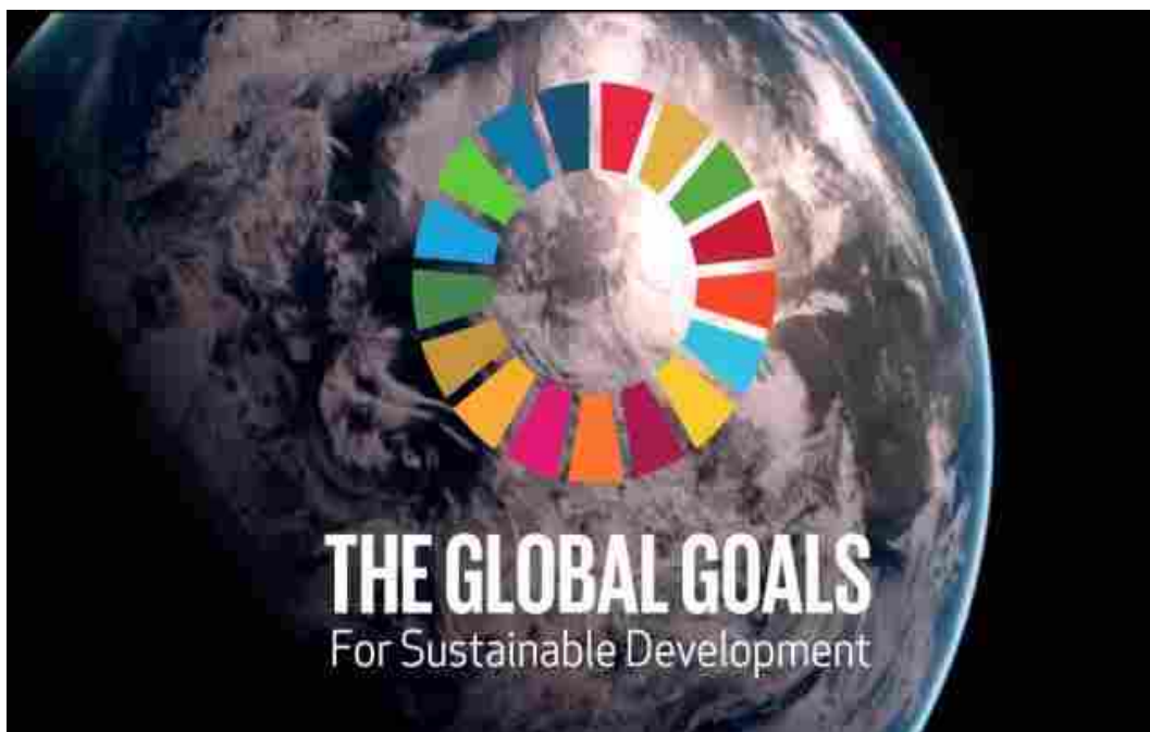
Figure 1. Still from the fundraiser video

One of the first activities is a fundraiser video that seeks financial support from people to fund the Global Goals. Narrated by actor Chiwetel Ejiofor of Twelve Years a Slave fame, the video summarizes the 17 goals, talks about the range of activities that were undertaken to disseminate the message in the world, and about the importance of making them ‘famous, famously effective’.