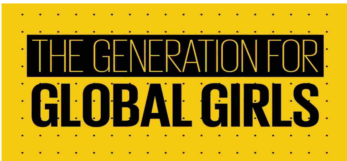
Figure 12. The video labels 2016 as the year of Global Girls