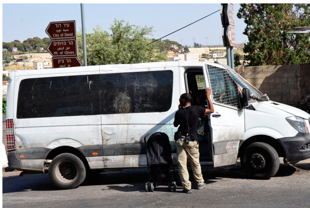
Figure 1. Private security guards providing transport services for Jewish-Israeli settlers, Silwan (Jerusalem), May 2015.

As Daniel's and Tal's account suggest, the PSCs relations with the police were established slowly on the ground, in the streets and yards of East Jerusalem. These close hierarchical relations were not initially prescribed from above, but were rather the result of interpersonal encounters and camaraderie on-the-ground, coupled with the necessity of allocating labour, equipment and responsibility in times of war. Only at a later point in time, following political and legal pressure, were these relations formulated legally through ministerial guidelines and contractual obligations. Recent (2014–2017) escalations in East Jerusalem have brought each time a temporary increase in police presence within Palestinian neighbourhoods, and closer operational ties with the PSCs; However, while Israeli (border) policemen are quick to come and go, Israeli private security guards remain, and