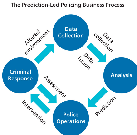
Figure 1. The prediction-led policing business process (from Perry et al. (2013, p. 128, Figure 5.4)).

The underlying model of predictive policing is represented in Figure 1. As Perry et al. (2013, p. 128) point out, predictive policing is 'not fundamentally about making crime-related predictions' but about implementing a prediction-led policing business process , which consists of a cycle of activities and decision points: data collection, analysis, police operations, criminal response, and back to data collection. At each stage of the cycle, choices are made regarding, for example, the types of data to collect, the duration and frequency of data collection and update, the types of analytical tools to