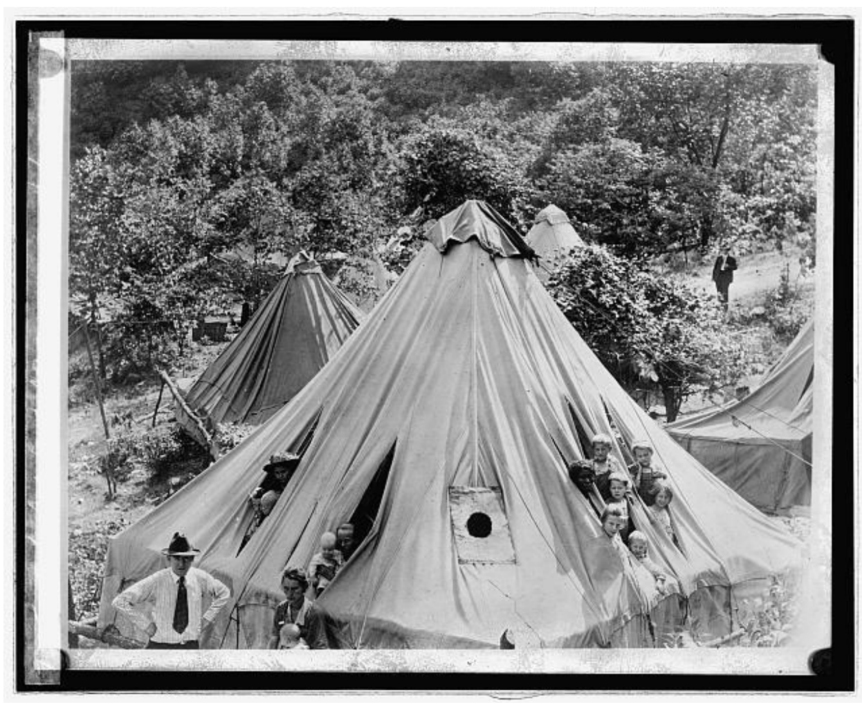
Figure 5. "Tents, Lick Creek, WV, April 12, 1922." Library of Congress Prints and Photographs Division. Washington, D.C.