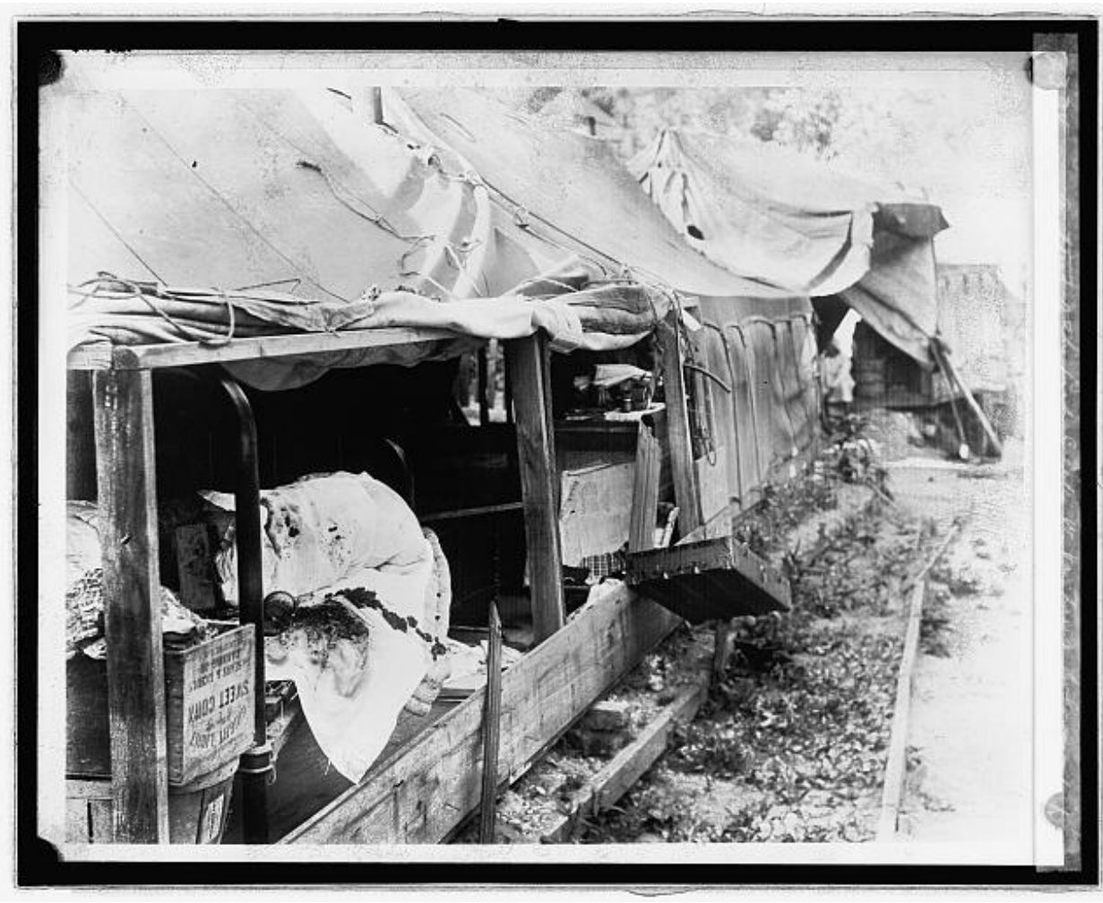
Figure 6. A tent of the Lick Creek, WV, tent colony, April 12, 1922.