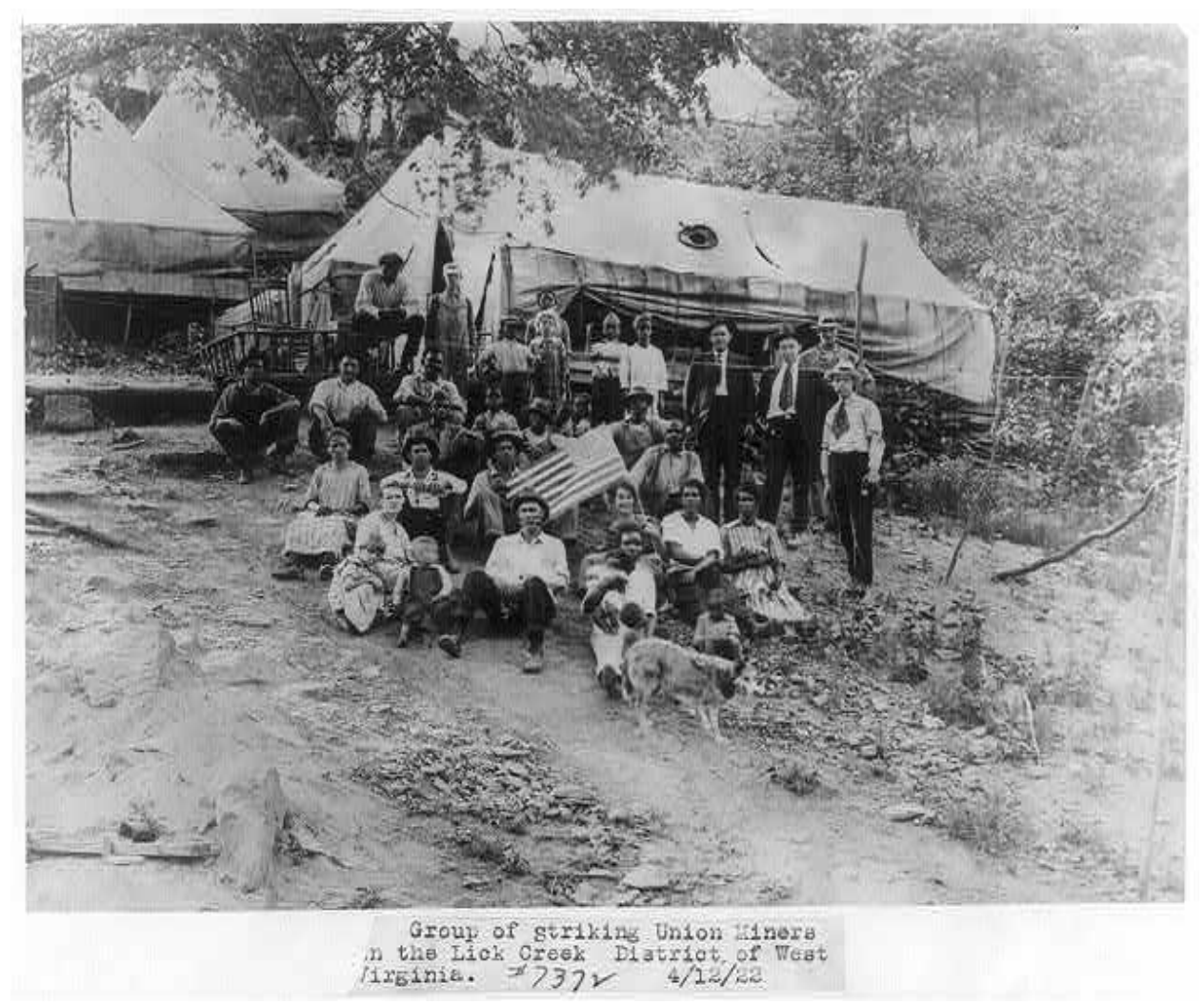
Figure 7. "Group of Striking Union Miners in the Lick Creek District of West Virginia, April 12, 1922."