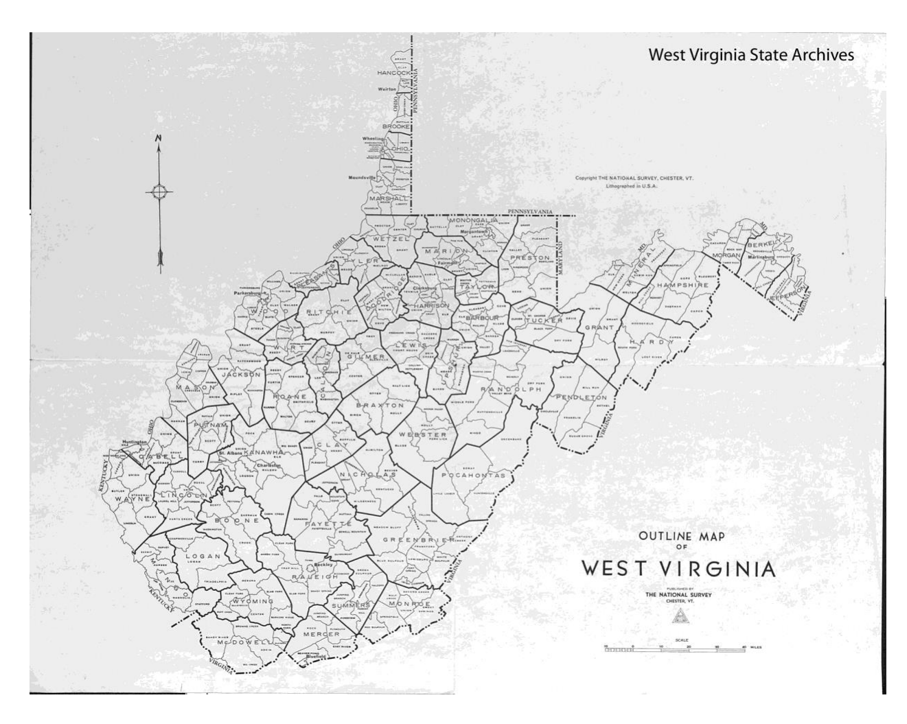
Figure 2. "Outline map of West Virginia." Published by: Chester, VT, The National Survey, [date not known].