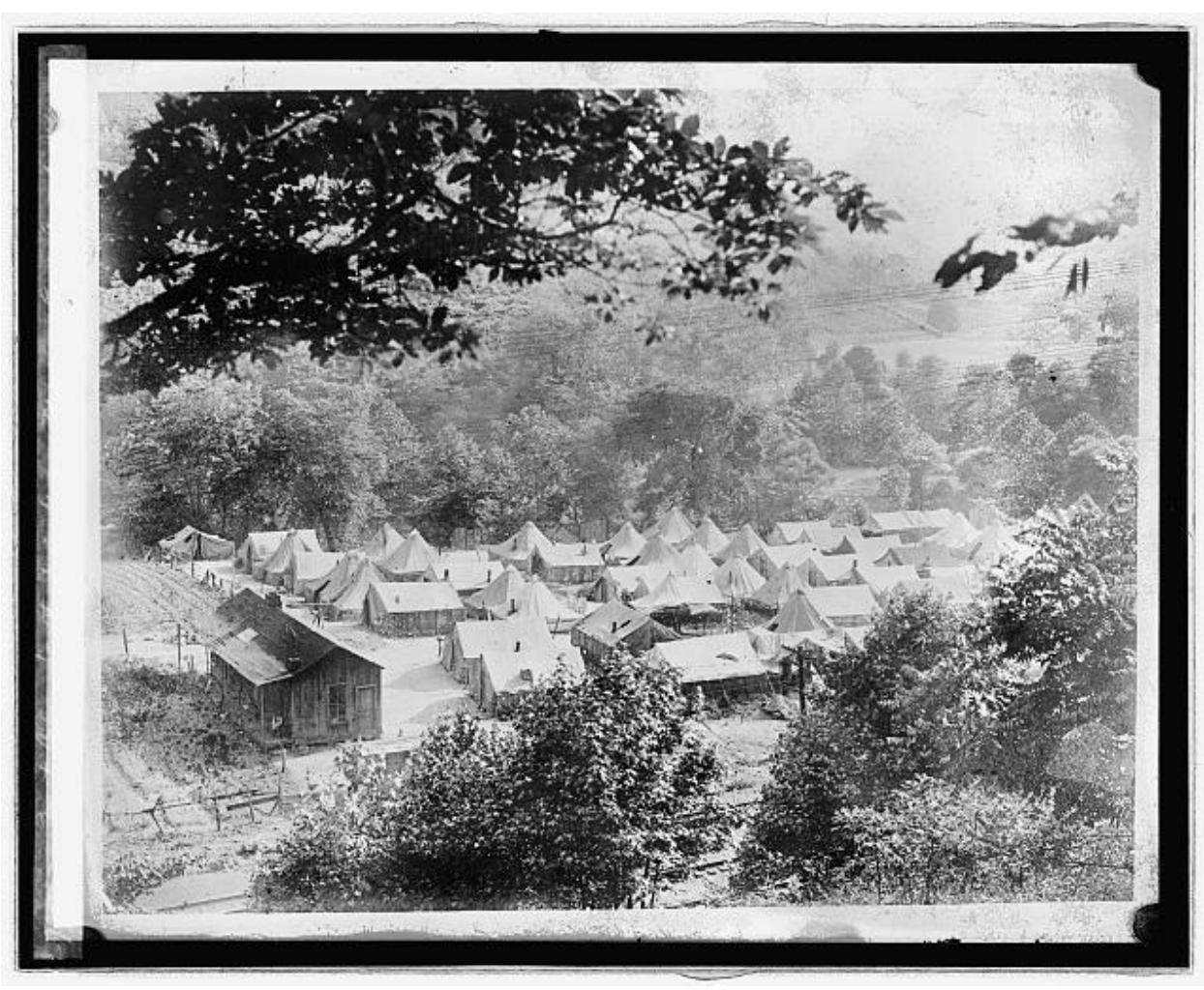
Figure 4. "Tent Colony of Striking Union Miners, Lick Creek, WV, April 12, 1922." Library of Congress Prints and Photographs Division. Washington, D.C.

Blackberry City forced Matewan mining families to rely on each other for survival and companionship. Families were able to survive the grim, comfortless conditions in the tents through the practice of skills like canning, hunting, folk medicine, husbandry, and gardening – skill sets miners brought to the mines from their lives before coal. These survival modes helped create community bonds – inter-family, inter-ethnic, and inter-racial bonds – that ultimately helped miners to join together to move toward community solidarity and unionization.