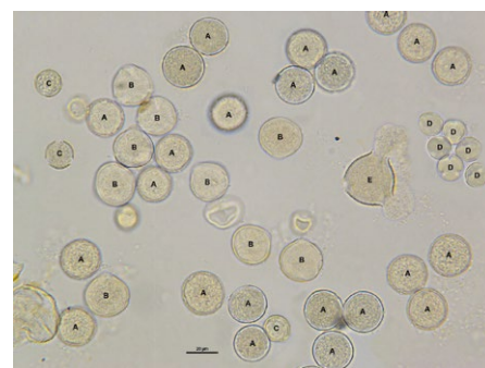
Figure 1. Image of pollen types from sample D. (A) Pollen from plantain ( Plantago spp.), (B) white clover ( Trifolium repens ), (C) meadowsweet ( Filipendula spp.), (D) Saint John's wort ( Hypericum spp.) and red clover ( Trifolium pratense ) are shown.

In the segregated pollen pellets, we could identify between four (sample E) and ten (sample C) different pollen types, which are shown in Table 1. However, the percentage of the individual pollen types within a pellet was highly variable. These proportions vary between 0.2% (samples B, C, and D) and 83.0% (sample C). To exclude the possibility of contamination from "foreign" pollen