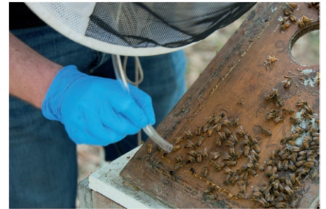
▣ Figure 3. Flipping the lid, reveals a couple of SHBs, clustering underneath a group of bees.

Mated SHB females can start ovipositing almost immediately after finding a suitable food source (De Guzman, Rinderer & Frake, 2015), thus keeping an eye out for eggs and larvae is important. However, SHB reproduction does not