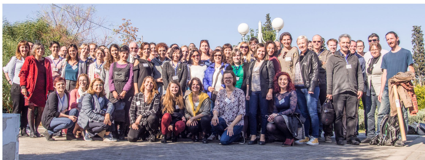
Figure 1. Attendants of the 13th COLOSS conference at the Agricultural University of Athens.