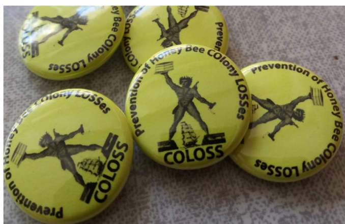
▲ Figure 7. The buttons for conference participants were yellow this time, according to the 2017 queen colour code.