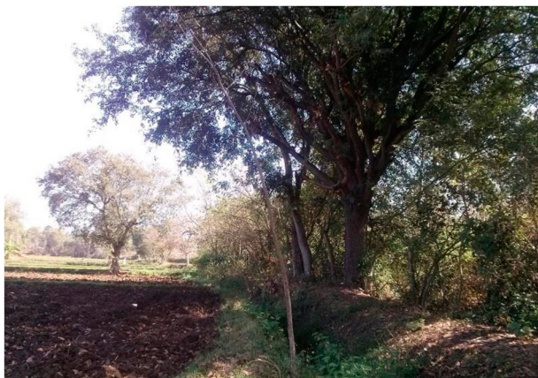
Figure 3. Pongamia trees’ large canopies casting a shade on the main food crops grown by farmers. Such shade and the trees’ extensive root systems reduced food crop productivity, according to farmers.

Furthermore, biodiesel feedstock trees on farm boundaries competed with the many other uses of these boundaries. In agricultural assemblages, the boundaries played a role as grazing patches for cattle, as pathways providing access to other people’s lands, and as grounds for planting fruit or timber trees. Many of these uses of farm boundaries yielded useful returns to farmers, but required less labour than harvesting biodiesel feedstock. Throughout our fieldwork, small-holder farmers and farmworkers voiced these issues based on knowledges