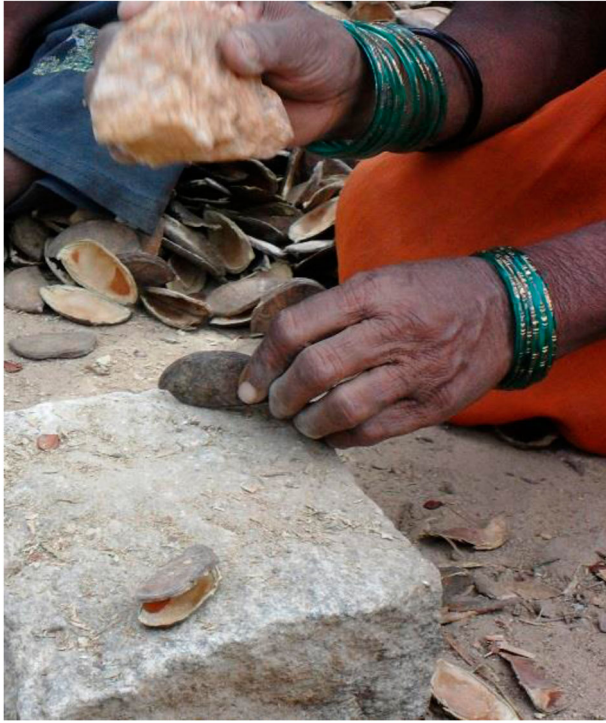
Figure 1. After collection, seeds were not ready for the market. Each seed also needed to be individually de-shelled, which was done by hitting the seed with a stone or stick. According to our respondents, this approximately doubled the amount of time required to get the seeds ready for market.

raise it to take it to 20% in the year 2011–12 beginning with 5% in 2006–07’ (Planning Commission, 2003, p. x). The 2003 Mission further pointed out how calculations on the achievability of these targets were performed using: (a) yield estimates of Jatropha curcas , presumably from agronomists’ test fields; (b) the expected oil content of Jatropha seeds extracted using a laboratory setup; and (c) the projected diesel demand in 2011–12 based on growth scenarios developed by economists. Relying on these the Mission calculates that a total of 11.19 million hectares of land were needed to achieve the blending target of 20% in 2011–12. No uncertainties were articulated. All differences between lands in terms of soil types and irrigation facilities were marginalized. The many interrelated entities constituting the political assemblages that produced oilseed yields (e.g. rainfall, irrigation, fertilizers, plant diseases, and pruning techniques) remained excluded.