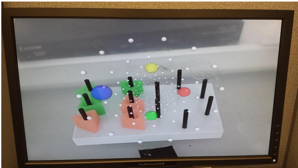
Figure 2. Two images from the ball-and-tunnel task. The top image (a) is the standard configuration to which each test image is compared. The bottom image (b) is an example of a change from the standard orientation, with the leftmost ball changing in depth.