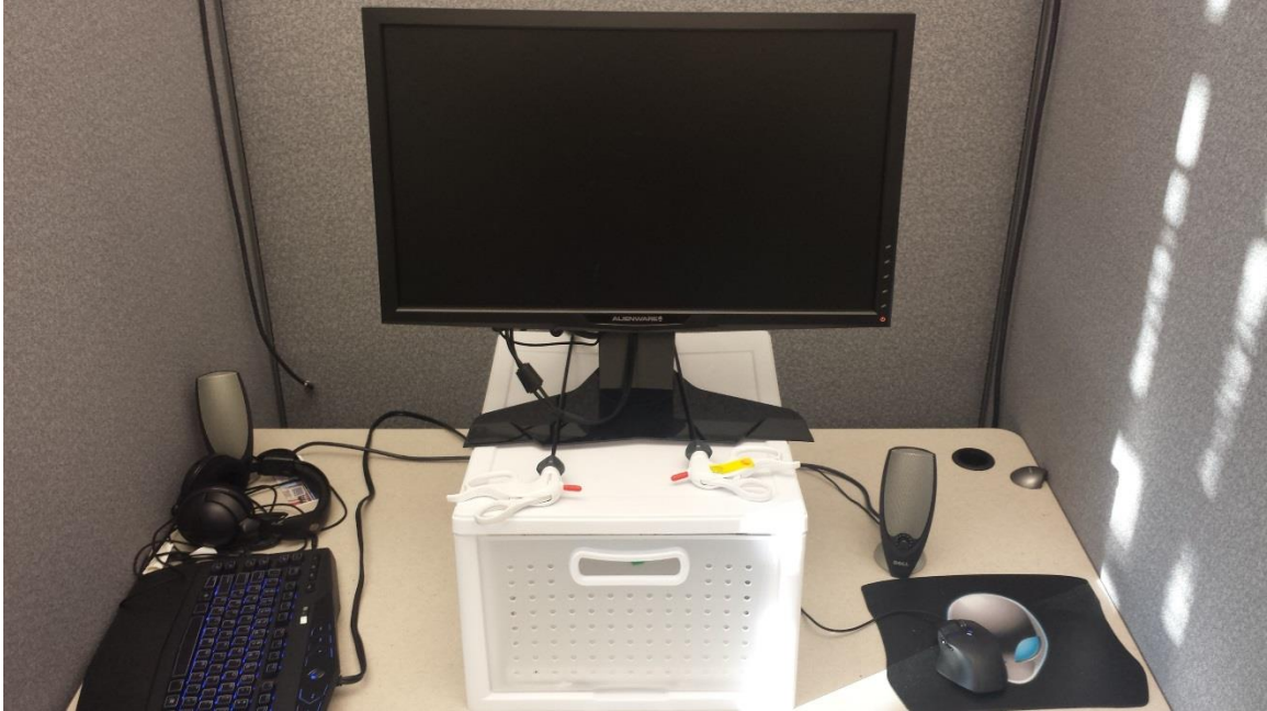
Figure 1. Laparoscopic box trainer.