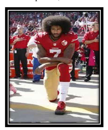
Figure 7. Colin Kaepernick, Former NFL Football Quarterback.

"I'm not going to stand up to show pride in a flog for a country that oppresses Black people and people of color. To me, this is bigger than football and it would be selfish on my part to look the other way."