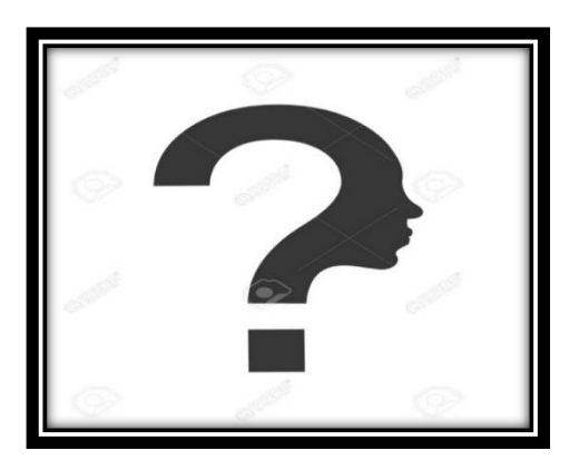
Figure 9. As a Black female early childhood teacher, what do you do?