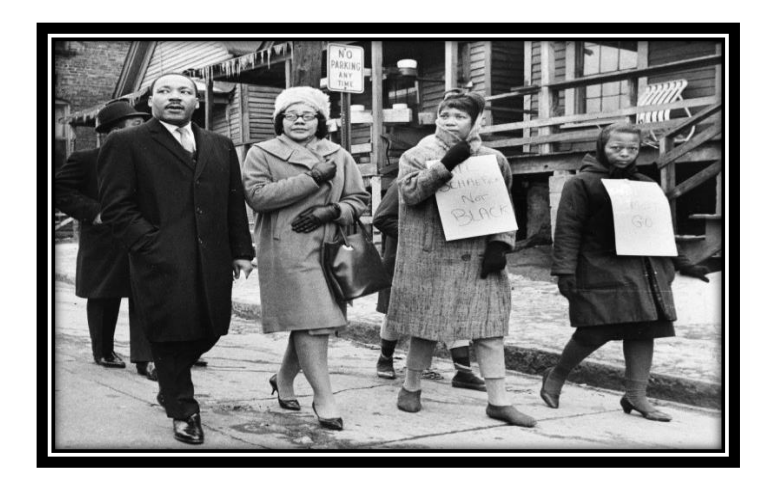
Figure 5. Martin Luther King, Jr., Coretta Scott King, and Women Protesters.

"Not enough attention has been focused on the roles played by women in the struggle. By and large, men have formed the leadership in the civil rights struggle...but women have been the backbone of the whole Civil Rights Movement."