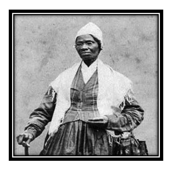
Figure 1. Sojourner Truth – Abolitionist and Social Activist.

"Nobody ever helps me into carriages, over mud puddles, or gives me any best place. And ain't I a woman?"