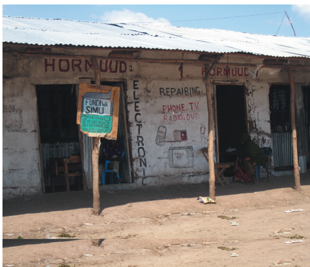
Image 1. Refugee repair and maintenance shop in Dadaab camp complex. (de la Chaux ©).