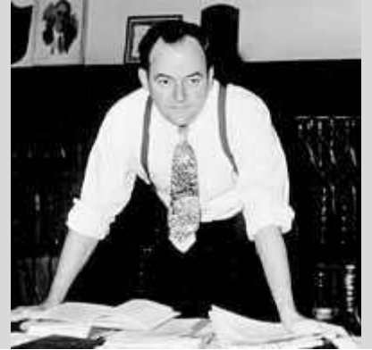
Figure 35. Hubert H. Humphrey shortly after being elected Mayor of Minneapolis in 1945. Humphrey was an ambitious political figure who had transitioned directly from being a graduate student in Political Science at the University of Minnesota to being a pivotal figure in the DFL Party. Humphrey would be elected to the Senate in 1948 and would later serve as Vice President of the United States.