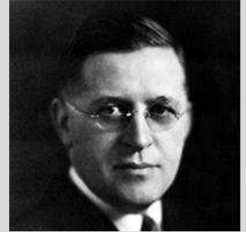
Figure 26. Elmer Benson in 1937. Benson was elevated to the U.S. Senate by the sudden death of Republican Senator Thomas D. Schall in December 1935. Benson would later return to Minnesota to seek the governor's office in 1936.

The month of December 1935 ended with even more trouble for Olson. On December 31, he underwent stomach surgery for what had now been diagnosed as a tumor. During the operation, he was found to have inoperable cancer. The operation itself was made public, but Olson's cancer diagnosis (which would eventually prove to be terminal) was kept secret. 141 From that point on, Olson struggled with his encroaching illness – even as he made plans for his political future and doggedly looked ahead to the election of 1936, when he planned to make the transition to the Senate. Olson's ambition for the Senate seat meant that there would be an opening in the party leadership for his governor's seat. This encouraged other party leaders to emerge as potential successors for the governor's office starting in early 1936. 142