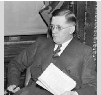
Figure 28. Elmer Benson in 1937. Benson was elected Governor of Minnesota in 1936 with the largest electoral margin ever up to that time.

Benson was dealing with a different political landscape in early 1937 than Olson had faced between 1931 and mid-1936. On the national level, the Democrats under Roosevelt were unquestionably the main agent of change – and a significant agent at that. The politics of the New Deal had greatly changed the American political landscape and had created Roosevelt's New Deal coalition which had shifted many voter groups into the Democratic