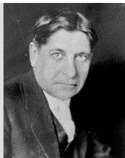
Figure 17. Thomas D. Schall was a practicing attorney when he was accidentally blinded by a faulty cigar lighter. Schall felt the effects of the blast immediately, but lost his sight gradually over a period of months. He continued his career as a lawyer and then a politician – often aided by his wife, who helped him to operate effectively.

However, Schall's earlier flirtations with the NPL were not enough to garner any significant support from the agrarian wing of the Farmer-Labor Party in the 1924 election. He was strongly denounced by The Minnesota Leader in October 1924 as being a deceptive and decidedly unprogressive candidate. Schall was labeled "the bitterest, bluemass pill" who "did more wriggling and twisting than a tomato can full of fish worms." The Leader went on to endorse Magnus Johnson, whose "record of one hundred percent progressive" was the clear preferable choice for Minnesota farmers. 86 As mentioned earlier, The Leader would shift its position on Schall less than three years later – evidence of a continuing farmer-labor split in the party, and of the remnant NPL diverging – at least somewhat – from the Farmer-Labor Party's official line.