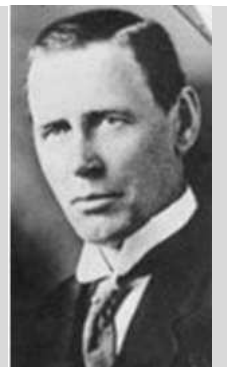
Figure 3. Charles August Lindbergh was a farmer, lawyer and Republican "insurgent" politician from Little Falls, Minnesota. Lindbergh was first elected to the U.S. House of Representatives in the Sixth District in 1906, and held that seat until early 1917. Later, he was the Farmer-Labor coalition's choice for governor during the Republican primary in 1918.

Lindbergh's opposition to the war was related to his views that common Americans were constantly being manipulated and cheated by large corporate entities. He contended that the war itself was a machination designed by the monied interests and armaments industry to generate profits while sacrificing American lives for a distant cause in which Americans should not be involved. At one point before American entry into the war, Lindbergh even proposed the idea that war production industries should be banned from making a profit. Later, just before the Wilson Administration asked for a declaration of war against Germany in April 1917, Lindbergh attempted to publish a book denouncing the concept of American intervention titled Why Is Your Country at War and What Happens To You After the War? The work alleged that America was being pushed into the Great War by "Wall Street" and the monied interests to generate business and to secure American loans that had been made to Britain and France. Before the work could be published however, the plates were seized from the printer's office in Washington, D.C. The manuscript survived and was later published after being edited to leave no doubt that Lindbergh fully supported the American war effort. 26