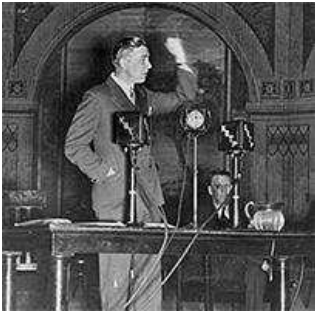
Figure 24. Governor Floyd B. Olson in 1932. Olson was well known for his dramatic and dynamic speaking ability. Olson remained an active public speaker during his years as governor.

the largest faction within the legislature. The state House was more responsive to Olson's leadership, while the state Senate remained controlled by the Republican opposition. Even so, the Farmer-Laborites often worked in conjunction with progressive Republicans and Democrats to form a working majority for many initiatives. 66 This factor would benefit Governor Olson during his second term. Despite these limitations, the election was widely considered a success, and the Farmer-Labor Leader proudly proclaimed that the voters had given their unflinching continuing support to Olson and other Farmer-Labor candidates. 67