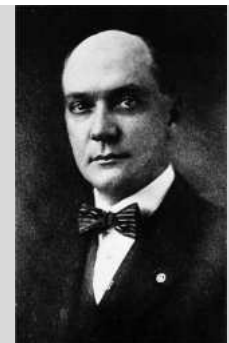
Figure 7. Thomas Van Lear in 1918. Van Lear had a long history of Socialist and pro-labor political activity in the 1910s. In 1916, he had been elected the first (and only) Socialist Mayor of Minneapolis. Later, he officially separated from the Socialist Party because of the war issue. Even so, he was unpopular with conservatives and business owners and was narrowly defeated in the 1918 mayoral election.

Just before the Minnesota State Federation of Labor conference in July 1919, Mahoney and Van Lear drafted a working document outlining the purpose and goals of their proposed new organization, then titled the “Working People’s Non-Partisan Political League of Minnesota.” This document included a preamble, which asserted that the recent war had been caused by “military, industrial and political imperialists” and that concerted effort by organized labor was needed to prevent wars in the future. The document’s “Declaration of Principles” further claimed that the wealth and resources of the country were “capable of supplying abundantly all the wants of the people” but that “comparatively few individuals . . . arbitrarily determine the share of wealth that the mass of people shall receive.” The