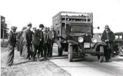
Figure 22. The Farmers' Holiday Association sought to raise farm prices by withholding agricultural goods from the market. Members of the association often formed road blocks to deter other farmers from bringing their goods to market as well.