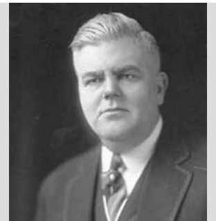
Figure 18. Theodore Christianson was one of the most able Republican gubernatorial figures in this period. Christianson was elected to the governor's office three times in the 1920s, often balancing the need for fiscal prudence against the demands of his Farmer-Labor opponents and conflicting views within his own party.

The Republican campaign of 1924 focused strongly on the Farmer-Labor Party's associations with communists and other radical groups. Christianson especially made charges of communist influence within the Farmer-Labor Party, even going so far as to note that the communist party in Minnesota had chosen not to run its own candidate in the governor's race