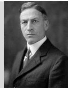
Figure 11. Ole J. Kvale in the 1920s. Kvale first ran for Congress in the 1920 Republican primary and had outpolled his opponent by a considerable percentage. However, the primary result was successfully challenged by his opponents, who accused him of falsely labeling Volstead an atheist.

Charles Lindbergh, Sr. also returned as a farmer-labor candidate in the 1920 election. After his unsuccessful primary campaign in 1918, Lindbergh had turned his attention to the publication of Lindbergh’s National Farmer – initially a large and attractively colorful magazine. The magazine’s content covered some issues of concerns to farmers, but was