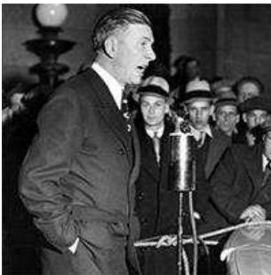
Figure 25. Governor Floyd B. Olson in 1935. Olson faced greater opposition as Governor of Minnesota after the 1934 election when his party took a decided turn to the left and the state legislature swung back into opposition hands.

standing investigative committees which often met in secret and had broad powers to look into any issue which might embarrass the Olson Administration. 125 Olson now played a different political game. He had cautiously pursued moderate reforms during his first term of office. In his second term, he had become more aggressive in pursuit of reform and economic relief. But in his third term, he laid out positions so extreme that they were doomed to failure – and then spent much of the rest of his third term on the defensive against the opposition-led state legislature. When the Republican-majority rejected his tax plan and instead proposed a state sales tax, Olson openly opposed it and eventually vetoed it. 126