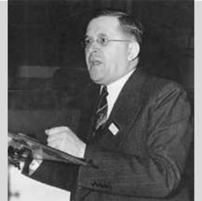
Figure 32. Elmer Benson giving a speech in 1938. Benson would face a serious challenge from his rival, Hjalmar Petersen, in the 1938 gubernatorial primary.

There were also some Farmer-Labor efforts to recruit Democrats to their cause in the 1938 election. This represented a shift, since until 1938 it had been the Democrats who had typically approached the Farmer-Laborites with such proposals. However, despite their poor showing in the 1936 election, the Democrats showed little interest in getting involved in the ongoing factional dispute within the Farmer-Labor Party, and no agreements were reached between the two parties in 1938. In the meantime, the Republicans had experienced their own internal struggles, but had then decided on and backed their rather moderate gubernatorial candidate, Harold Stassen. This was a significant shift, since Stassen was considered to be young, dynamic and relatively progressive. Many Old Guard Republicans did not regard him