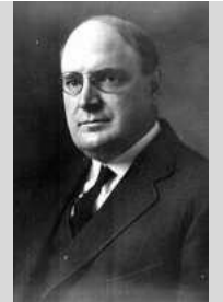
Figure 4. Governor Joseph A. A. Burnquist in the early 1920s. Burnquist had assumed office upon the death of Governor Hammond in 1915. Burnquist chaired Minnesota's Commission of Public Safety starting in April 1917, an entity which is often cited as being one of the most repressive in the state's history.

The outbreak of war in April 1917 had presented the NPL with a dilemma, since its organizing efforts were now increasingly viewed with suspicion by the state government. Even so, such activity was absolutely essential to its mission. The NPL leaders continued to focus on domestic agrarian issues in their recruitment efforts, and contended that such a discussion of domestic issues was warranted and protected by the Constitution and the First Amendment. However, the League's critics and opponents viewed their actions differently. It