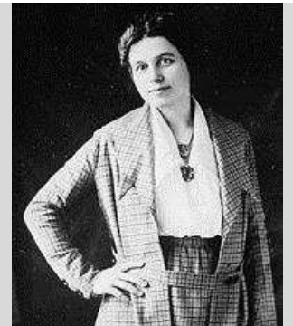
Figure 15. Anna Dickie Olesen was the first female to ever run for the U.S. Senate on a major party ticket. Although she did not win the general Senate election of 1922, her campaign raised the Democratic percentage of the vote to one of its highest levels for a state race in that year.

The general election was held in November 1922. All of the results were not immediately known, due to the various rates of vote reporting (and the slower means of calculating votes typical of that period). However, as the votes were counted, it became apparent that the Farmer-Labor Party had finally scored some major victories. By mid-November, all of the results had been tabulated, and the news for both the Republicans and the Democrats was not good.