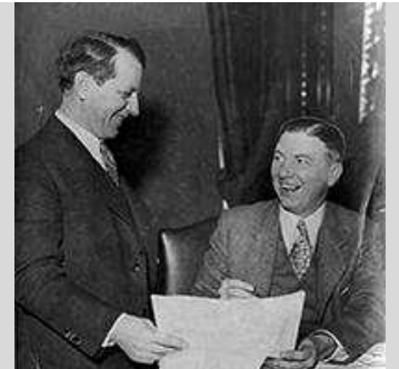
Figure 21. Vince Day (left) with Governor Floyd B. Olson in 1934 as Olson signs a bill allowing for $5 million in relief funds to be funneled into Minnesota. The Olson-Day partnership was effective chiefly because Day preferred to advise, manage and administer rather than become a political figure himself.

Once Olson had officially been inaugurated into office, a serious rift soon emerged between his administration and the FLA over the issue of party patronage. Many activists within the party and the association wanted state jobs and thought that Olson's tenure would make this a reality (and that such rewards were due to them for their support and loyalty). The rising unemployment due to the growth of the Great Depression only heightened this debate. However, Olson was cautious about stuffing state offices full of party members – at first. He typically resisted calls for the stronger use of patronage as a means to control the state government in his early years in office. However, over time Olson saw the advantage of dominating state bureaucracies with party loyalists who would not only enforce Farmer-Labor policies but who would also increase numbers in the FLA (whose membership surged dramatically after 1931). After May 1933, a significant number of offices would be filled in a patronage system which used the county chapters of the FLA as a “clearinghouse” for state jobs. Interestingly enough, Day appears to have shifted his stance on patronage by February 1935, going so far as to meet with Farmer-Labor heads and “suggest” that they not