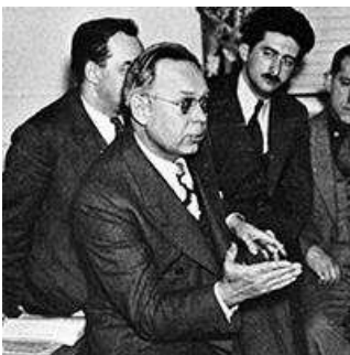
Figure 27. Hjalmar Petersen in 1936. Petersen was a long-time Farmer-Labor figure and loyalist to Governor Olson, but he clashed markedly with Benson and his supporters within the party. Petersen's rise to the governor's office in August 1936 practically guaranteed that the party would experience considerable factionalism.

Throughout 1936, other ambitious Farmer-Labor figures – long in the shadow of Olson – positioned themselves to ascend to the governor's office. Although Elmer Benson had been appointed Senator, his real ambition was to become governor – and the state party's new leader. Likewise, Olson's lieutenant governor, Hjalmar Petersen, wanted to run for governor as well. An intense and negative competition between Benson and Petersen had emerged since Benson's appointment to the Senate in December 1935. Olson's Senate ambitions in 1936 only exacerbated this rivalry. According to some, Petersen's opposition to Benson was both ideological and ethnic. The historian Hyman Berman alleged that Petersen was anti-Semitic and resented both Olson's reliance on Jewish leaders within the party (such as Abe Harris, Olson's speech writer and an editor of the Farmer-Labor Leader ) and Benson's extensive associations with "Mexican generals" – a slur meant to refer to leading Jewish figures within the party. 144