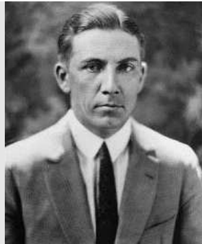
Figure 16. Floyd B. Olson first rose to political prominence in 1924, when he ran for governor on the Farmer-Labor ticket. The ambitious Olson had made a name for himself as Hennepin County Attorney – often taking on controversial cases which had led to a high profile for him by the early 1920s.

successfully run for County Attorney of Hennepin County (which included the City of Minneapolis). 83