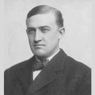
Figure 9. Jacob A. O. Preus in 1918, running as a candidate for the State Auditor's office. Although strongly associated with the mainstream Republican Party, Preus took great pains to portray himself and his gubernatorial agenda as being moderate and friendly to farmers' interests.