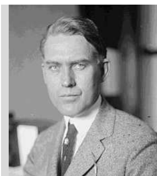
Figure 10. Henrik Shipstead in an undated photo from the late 1920s. Shipstead was one of the Farmer-Labor Party’s earliest and most dynamic candidates. Shipstead would eventually become the longest-serving Farmer-Laborite in Congress.

supporters from challenging the decision and later even campaigning alongside Shipstead. 64 Shipstead plunged into yet another Republican primary campaign. This was his first statewide campaign, and he undertook it with humble means, often driving himself in his own car from town to town, stopping to speak at meetings and church socials, and asking for campaign donations in the form of “gas money” to get him to his next destination. 65 As in 1918, Shipstead faced significant hurdles from the Republican opposition – including being shut out of an auditorium in Duluth. 66 Even so, Shipstead was so popular a figure, that there were a number of predictions that he would win the primary race. 67 In the end however, Shipstead lost the primary – but he had built up a state-wide voter base and had honed his campaign skills. Following the strategy used by the coalition in 1918, he was then endorsed by the NPL as an “Independent” for Governor in the 1920 general election, and he continued to run a similar campaign in the general election. 68 This double campaign of 1920 would bring him into direct contact with thousands of Minnesota voters and help to propel his reputation as a candidate of note.