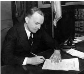
Figure 34. Governor Harold Stassen signing a bill in 1940. Stassen was a moderate Republican who challenged his own party as well as the Farmer-Labor opposition.

was also outraged over Stassen's civil service reforms which resulted in the termination of the overwhelming majority of Farmer-Labor appointees in the state bureaucracies between January and July 1939 – even though abuse of party patronage had been one of Petersen's main issues in the 1938 primary. Petersen had now found a new political cause, and he would identify Stassen from this point on as being his main political enemy (even though his feud with Benson would continue as well). 108