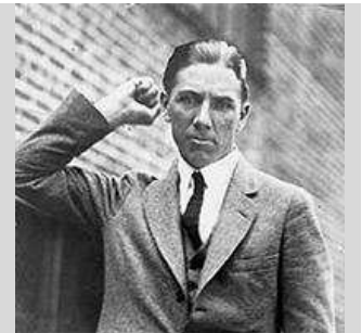
Figure 20. Floyd B. Olson in 1931, shortly after he was first elected to the governor's office. Olson had made great gains in his political abilities between his first run for office in 1924 and the 1930 campaign.

caused by a reckless speculation of moneyed interests such as stock brokers and big businesses. The second was the Republican Party's long-standing reputation both on the state and the national level as being the pro-business or laissez-faire party, which largely refrained from government intervention in the economy. With the onset of the Great Depression in the early 1930s, fears over unemployment and deflation were beginning to take hold of Minnesota voters. That factor – combined with the fact that the Republicans typically refused to consider a more interventionist economic policy - convinced a critical mass of centrist voters that an alternative approach was needed. The election of Floyd B. Olson as governor (the first third-party candidate to ever achieve this distinction in Minnesota) was an indication of impending political changes to come on the state level – and the national level as well. These national changes would become evident in 1932 with the election of Franklin D. Roosevelt to the presidency and a Democratic sweep of both houses of Congress. 26