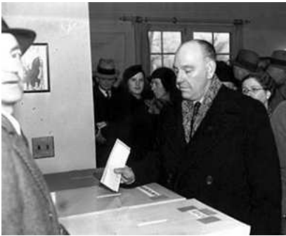
Figure 31. Ernest Lundeen casting his ballot in 1936. Lundeen had enjoyed a considerable political career before moving from the Republican Party to the Farmer-Labor Party.

Justice Department denied this rumor on September 17. 71 But in fact, the FBI had indeed targeted Lundeen for his German connections, especially his ties with the suspicious pro-Nazi figure, George Sylvester Viereck. An official FBI investigation concluded in 1942 officially accused Lundeen as being under Nazi influence in the months before his death. By this time, America was embroiled in the war and the public had little sympathy for any pro-German views. 72