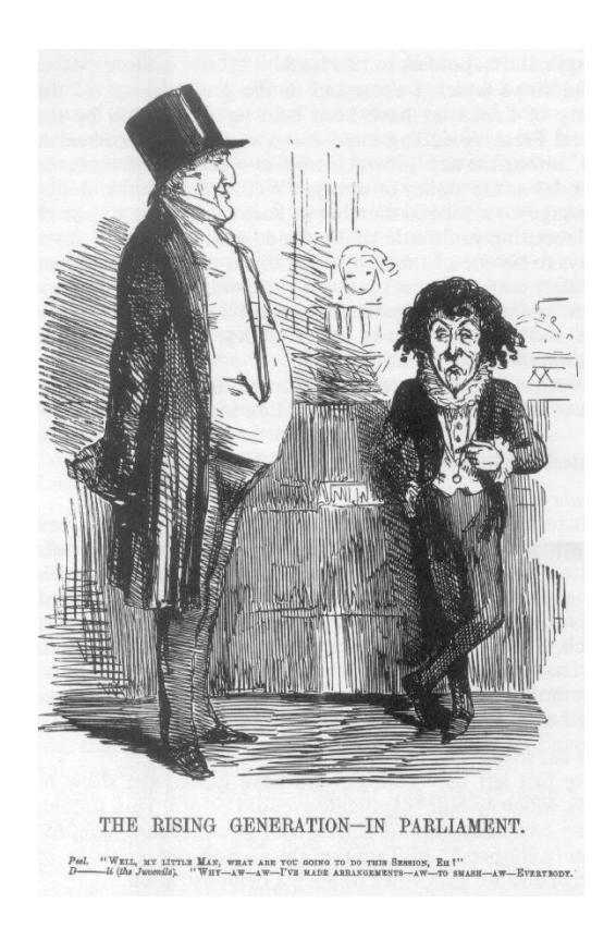
Figure 2. The Rising Generation in Parliament

Punch's depiction of Disraeli in 1847 illustrated both the continued division of Conservative forces and the widespread mistrust of Disraeli after his brutal treatment of Peel in June of 1846. Many of the Peelites felt Disraeli's attacks on the Prime Minster were completely uncalled for and could not see themselves reunited with a 'snake in the grass' such as he. Likewise the Protectionists were not too keen on a reunification either as they believed Peel had been abandoning Conservative institutions right and left in favor of national prestige and Whig appearsement. 303