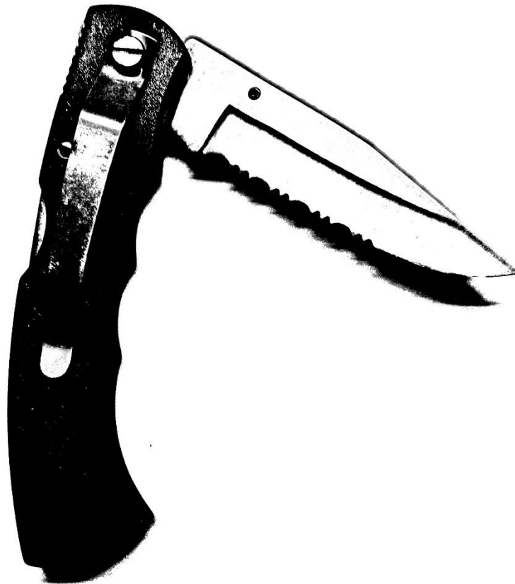
EXHIBIT C: PHOTOGRAPH OF [SCOTT WILSON'S/JAMAL HOWARD'S] POCKET KNIFE

Note: The blade of this pocket knife is approximately 3” long.