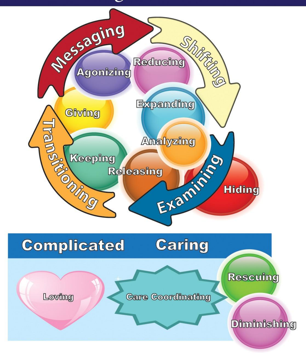
Figure 1. Parenting to Posthumous is a five-stage interactive process that is synergistic and non-linear. The circle has a foundation of connecting and caretaking. However, the circle could be rotated as each concept could begin from this foundation or in a more sequential process. Much of this process is internal and the dimensions or subcategories may not be immediately visible from an external view.

have also had challenging teenagers. Each described a parental journey into young adulthood that included dawning recognition of a significant diagnosis followed by frantically trying to offer therapy, interventions, or treatment for a child who did not