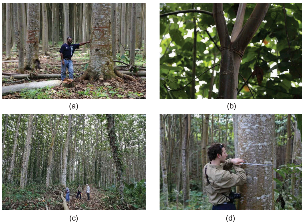
Figure 3. East New Britain balsa plantation and tree characteristics (a) balsa 'plus' tree (age ten years); (b) jorquette branch whorl in a 12-month-old balsa tree; (c) six-year-old stand ready for harvest (average DBHOB 38.3 cm (range 27.0–49.8 cm)); (d) six-year-old balsa tree in that stand

For many ENB smallholders with available labour, purchasing seedlings may be the only cash expense associated with O. pyramidale plantation establishment. It has been established practice to plant at 3 \times 3 m ( 1111 stems \text{ha}^{-1} ), and to refill stands at ages up to three months if there is tree mortality, so full stocking is maintained. Smallholder growers are often reluctant to thin to waste, as they consider doing