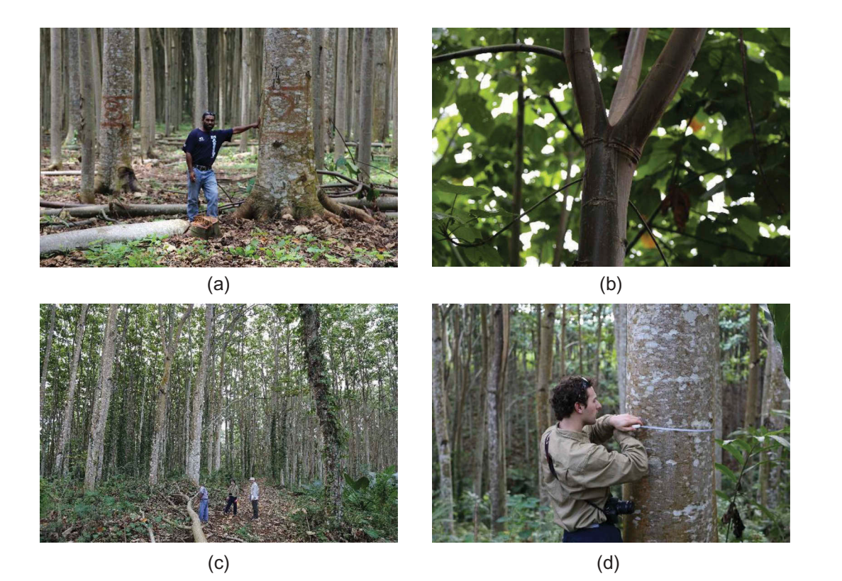
Figure 3. East New Britain balsa plantation and tree characteristics (a) balsa 'plus' tree (age ten years); (b) jorquette branch whorl in a 12-month-old balsa tree; (c) six-year-old stand ready for harvest (average DBHOB 38.3 cm (range 27.0–49.8 cm)); (d) six-year-old balsa tree in that stand

For many ENB smallholders with available labour, purchasing seedlings may be the only cash expense associated with O. pyramidale plantation establishment. It has been established practice to plant at 3 \times 3 m (1111 stems ha<sup>-1</sup>), and to refill stands at ages up to three months if there is tree mortality, so full stocking is maintained. Smallholder growers are often reluctant to thin to waste, as they consider doing