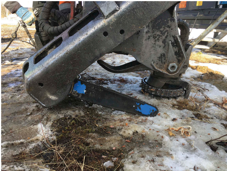
Figure 1. A typical position of the saw when changing the saw chain on a harvester head