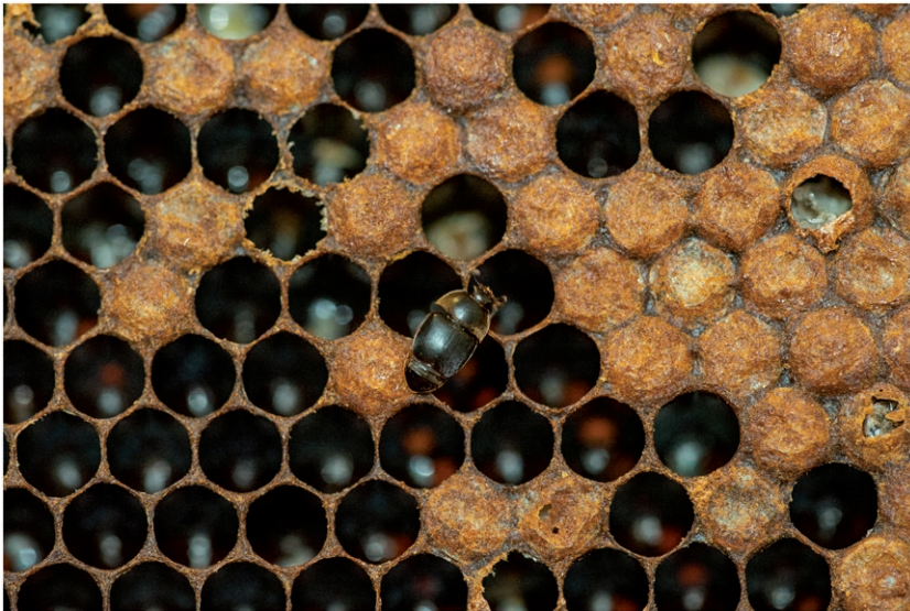
Figure 1. Adult SHBs running over a honey bee brood comb ( A. mellifera scutellata) and hiding in empty brood cells. Please click the image to play Video 1. Alternatively, this video can be viewed via the supplemental material tab here: http://dx.doi.org/10.1080/0005772X.2018.1465374. Video recorded in the laboratory of SIRG at the University of Pretoria, South Africa, December 2015.