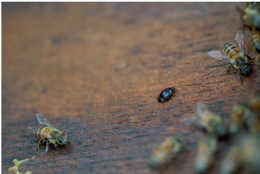
Figure 2. SHB seen running and trying to hide from honey bees ( A. mellifera scutellata) on a flipped over lid of a hive at the experimental farm of the University of Pretoria, November 2015. Please click the image to play Video 2. Alternatively, this video can be viewed via the supplemental material tab here: http://dx.doi.org/10.1080/0005772X.2018.1465374.