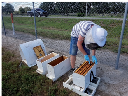
Figure 6. A set up for screening nucs for SHB adults using two empty boxes. Although this set up works well in general, there is no white surface underneath the nucleus colony, allowing SHBs to escape unnoticed.

an aspirator ready as well as a second white surface to shake bees onto. Also prepare a hard surface (wooden) to knock frames and other hive material onto.