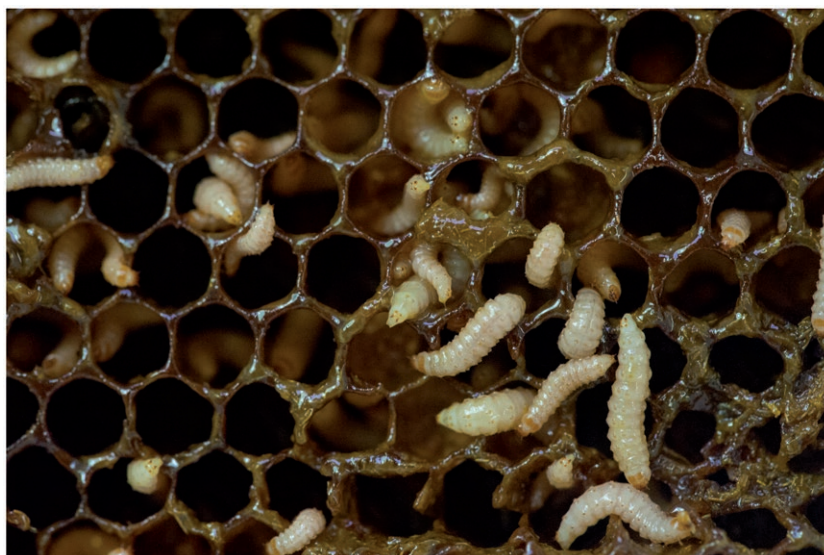
▣ Figure 5. The signs of SHB mass reproduction: larvae and slime. Drone brood comb, heavily infected with SHB larvae of different developmental stages. This brood was collected for research purposes and incubated in the laboratory at 30°C. It contained an adult female SHB, resulting in mass reproduction. Please click the image to play Video 3. Alternatively, this video can be viewed via the supplemental material tab here: http://dx.doi.org/10.1080/0005772X.2018.1465374. Video recorded in the laboratory of SIRG at the University of Pretoria, South Africa, November 2015.

Do not trust your eyes. Once a hive is opened, it is essential to use all means necessary to get SHBs to leave their hiding