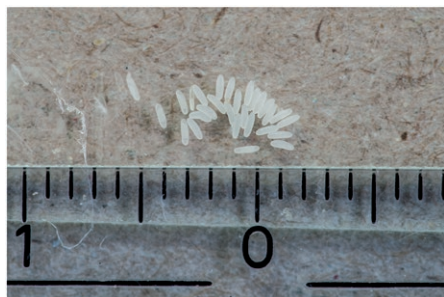
▣ Figure 4. Small hive beetle egg clusters oviposited between two microscope slides spaced apart approx. 0.3 mm.

similar in shape and size (Ellis, Graham, & Mortensen, 2013) though these are generally less active. Since very similar looking beetle larvae may also be found in hives (Maitip et al., 2017), identification by a taxonomist or PCR (Ouessou Idrissou et al., 2018) is required for positive identification of SHB larvae.