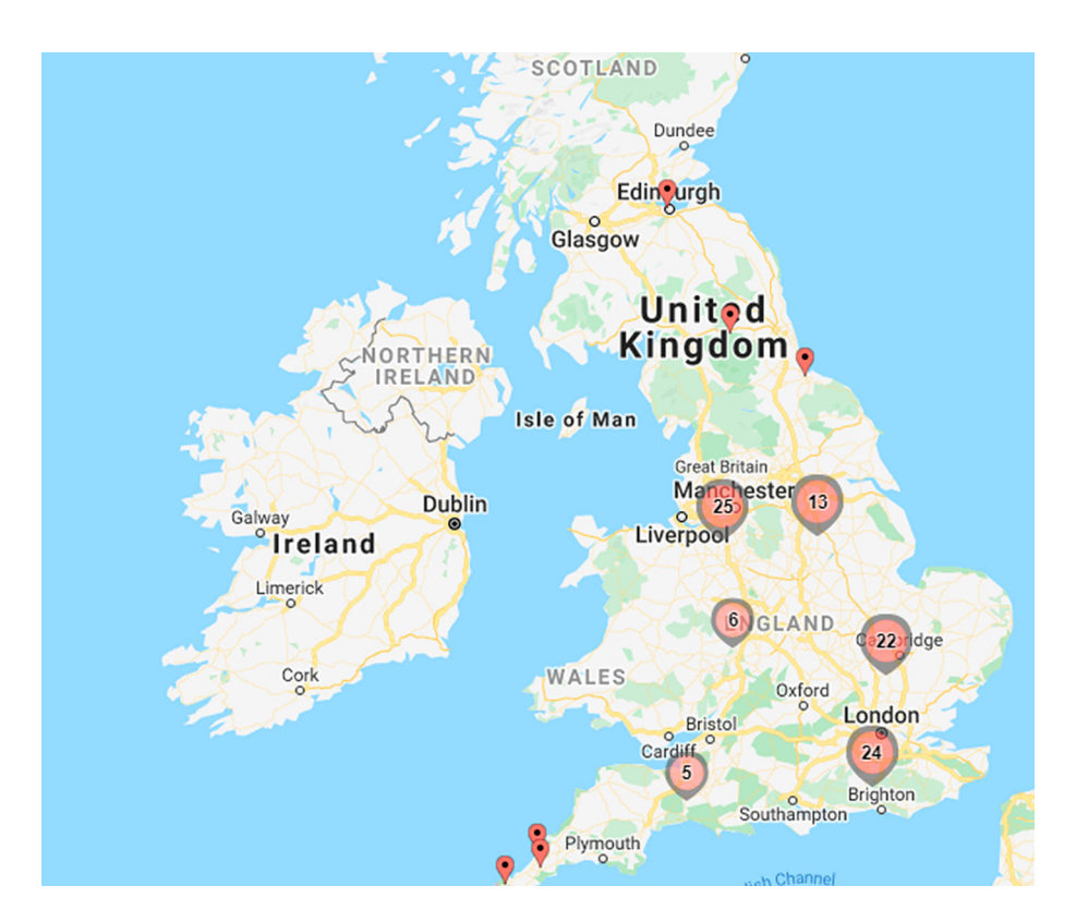
Figure 2. Geographical spread of respondents who provided postcode data (n = 101).

pet. Organizations which allowed pets were significantly more likely to be approached for accommodation by homeless pet owners (p = 0.0006).