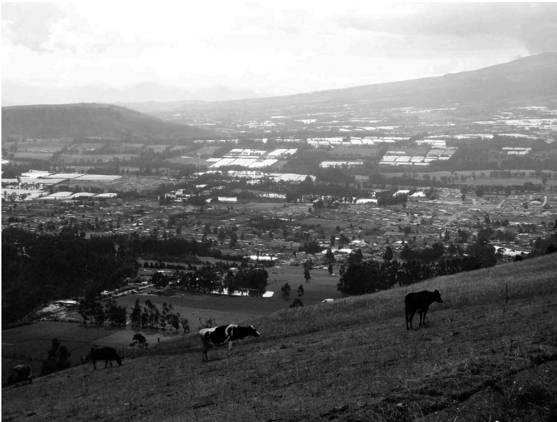
Figure 1. Part of the Pisque River watershed, showing the white plastic of large and small rose greenhouses.

The unequal water allocation and bad service towards the small landowners by the municipality led to a massive protest in 2006, after which indigenous communities took control of the system. In 2008 the water users’ organization received the official