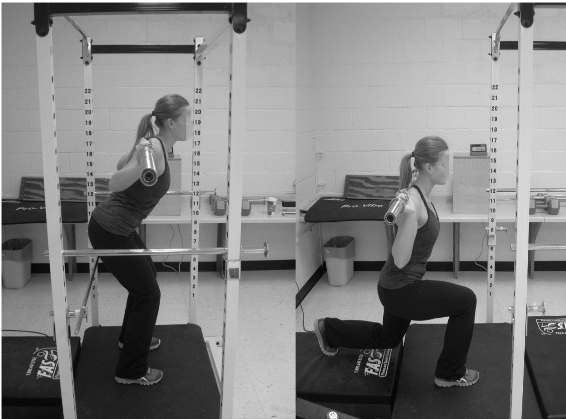
Image 1: Demonstration of Laboratory ; (1a; left) Isometric and isotonic squats will be completed to a knee angle of 120^\circ , (1b; right) left and right leg lunges should be completed in alternating fashion.

Isometric squats were completed to a knee angle of 120^\circ with the legs shoulder width apart. Participants were instructed to hold 40% of their body weight at the 120^\circ knee angle for 10 seconds (see Image 1a), then return to upright standing position for 5 seconds while still holding the weight. This process was completed 4 times, totaling 1 minute of activity. The participants were given another 1 minute bout of rest where they can move around if they desired to do so.