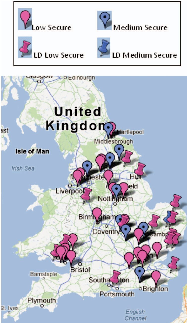
Figure 4. Map of independent sector medium and low and learning disability services. Map pins are spaced, where relevant, to convey the presence of multiple units in a single location.