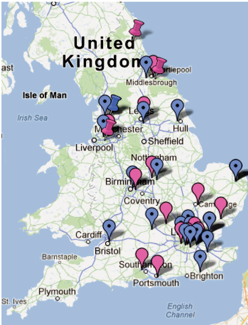
Figure 3. Map of NHS medium and low and learning disability services. Map pins are spaced, where relevant, to convey the presence of multiple units in a single location.