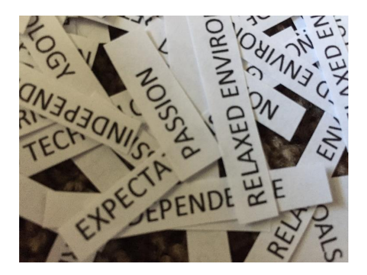
Figure 3. The Many Codes

The first step I took was to organize the codes alphabetically. This allowed me to see the frequency of each code. After I organized the data alphabetically, I then began to look for patterns. I combined similar codes into categories. A category represents a unit of information composed of events, happenings, and instances (Straus & Corbin, 1998). The constant comparative method was applied to continue to compare data being gathered to the emerging categories. In this way, I could see the relationships among and between the codes. My background as an educator helped tremendously at this point.