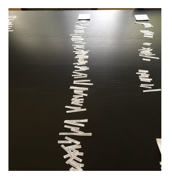
Figure 5. Emerging Themes

Through this process, I found many common categories and some contrasting ideas within the interview data. From these multiple categories, I could then see commonalities. I then began to put common categories together under several universal themes that emerged from the codes and categories. The relationships between and within the emerging categories allowed me to find relevant themes (Creswell, 2007). The observation, field notes, and school documents were used to further validate or refute the interview data. In this way, the data collected was used to check for accuracy of emergent themes.