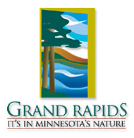
Figure 3 – It's in Minnesota's Nature Brand Logo

The image selected to represent Grand Rapids is a rather intricate interplay between water, air and a tree encased by a border intended to be an open door. The logo was created to represent an invitation into Minnesota's nature.