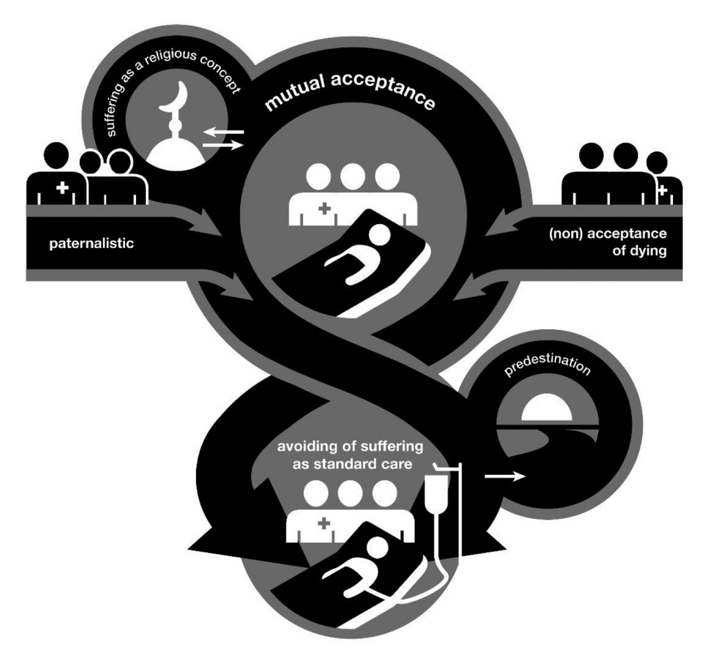
Figure 1. Discourses and their interaction between Muslim doctors and care recipients in palliative care.

represents the dominant power of the avoidance of suffering as standard medical care discourse. This discourse gives direction to all action orientation, as confirmation of its dominance. The loop, which represents the route leading to it, encounters four complementary discourses: the mutual acceptance discourse, the paternalistic discourse and the acceptance of dying discourse. These all share a functional subordination to the realisation of the dominant discourse. If there is no acceptance of dying or if doctors approach suffering as a religious concept (which is incompatible with their professional ethics), it will be hard for the decision to gain mutual acceptance, and the only way to enter the central loop will be by way of the paternalistic discourse. In other words, when relatives do not accept that the end of a loved one's life is near and/or that steps must be taken to combat his/her pain, the attending physician will have their work cut out to get them to agree with palliative sedation. The outer area of the figure embeds one the predestination discourse. This, we would argue, has no direct influence on the action orientation of the doctors, but it does constitute the desired or unwanted religious side-effects that arise from the dominant discourse.