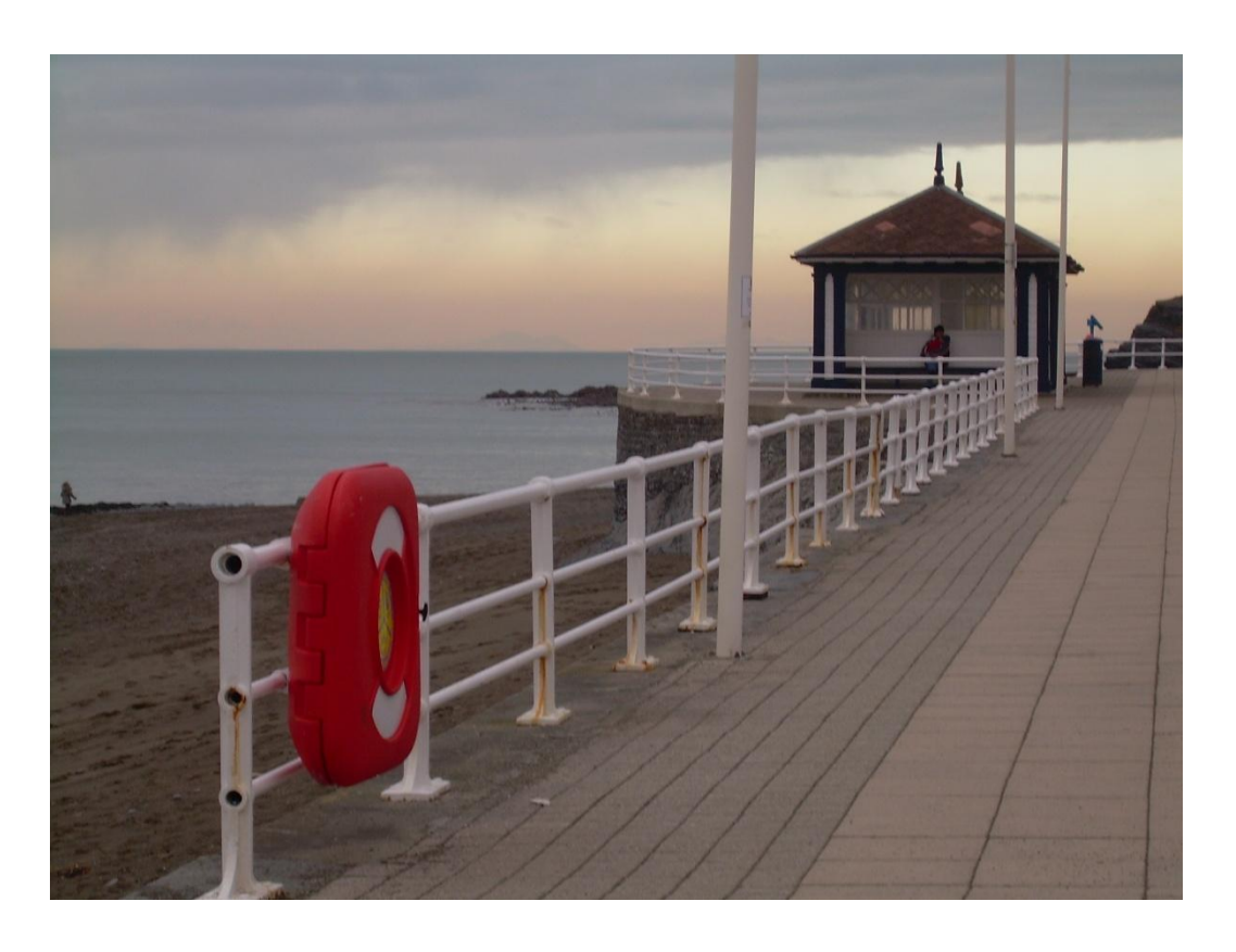
"I'll meet you in the shelter"