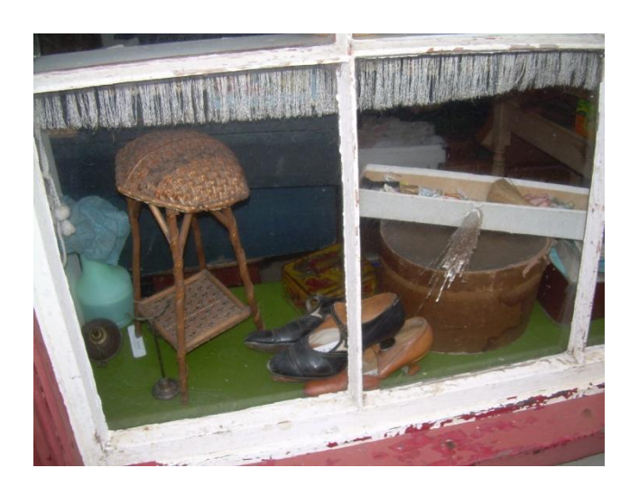
The Old Draper's Shop

made discoveries along the way, such as the surprise of the old Draper's shop, itself an installation used in a television series, which I incorporated into the piece, as I felt the discoveries I made during the process were important to share with my walkers.