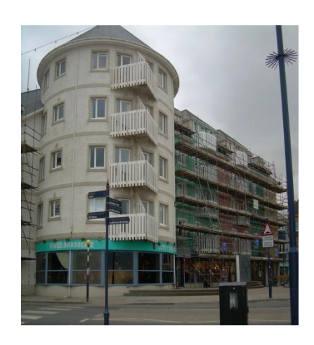
The site of the old King's Hall

One expert's remembrance of the place was also imbued with political perspective, and illustrative of the divisions I had felt myself. He is a lifelong Aberystwyth resident, now retired, and speaks of the division he feels between the university and the town, symbolised for him in the knocking down of the former Kings Hall, and the rebuilding of the theatre up on the university campus. As a representative of the university I felt the responsibility to let him be heard as a means of bridging the gap: