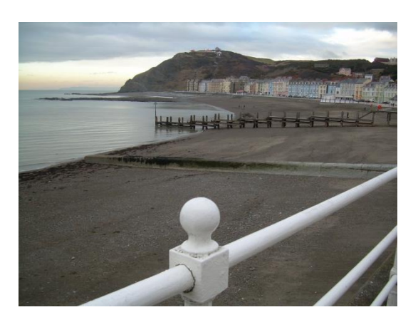
"Half an hour in the bay! Half an hour in the bay!"

introspection are among life's most refined pleasures." 15 This being the case, my state of feeling alienated from the community was an ideal starting point for this project, as an investigation into the unseen significance of paths and places, the intangible traces which gave rise to the name I gave the work.